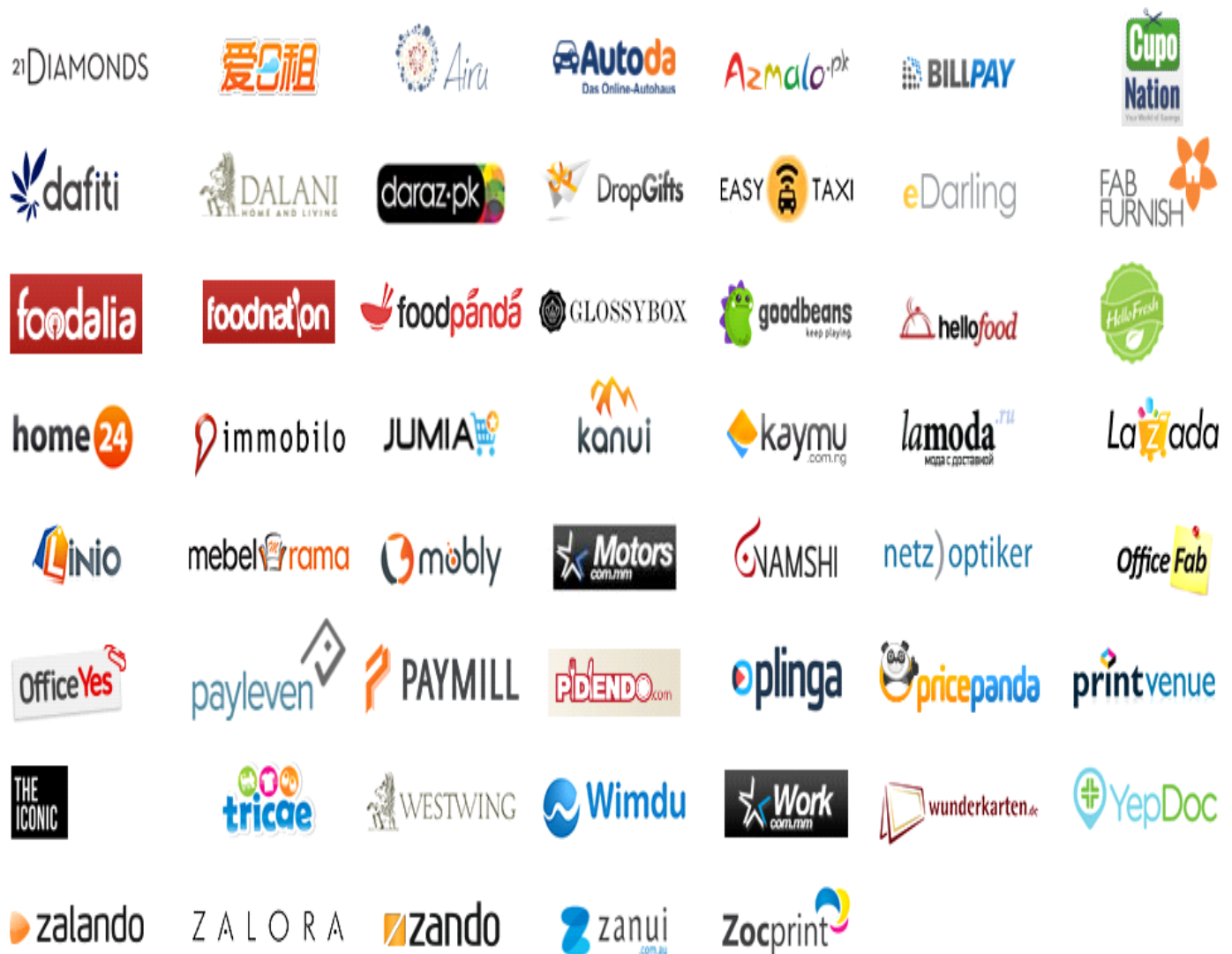
Figure 3: Successful Business Models of Rocket Internet around the World