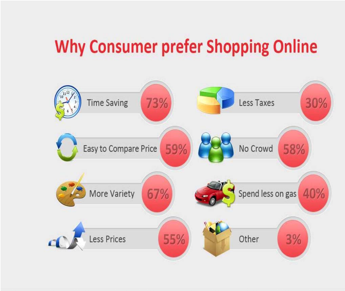
Figure 1: Why Consumers Prefer Online Shopping, Source: www.quartsoft.com

This report looks into the operations of Kaymu in Bangladesh especially focusing on the issues faced by a new business and its prospect in the Bangladeshi e-commerce market. The following chapters contain more in-depth information and analysis on this matter.