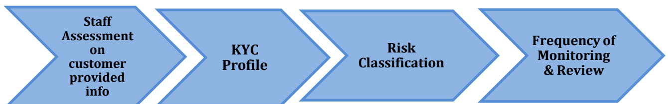
Figure 2: know your customer procedures

So, the overall process starts with assessment then towards building The KYC Profile that leads to Risk Classification of the Account as High/Low Risk. High risky customer is reviewed more than the less risky customer.