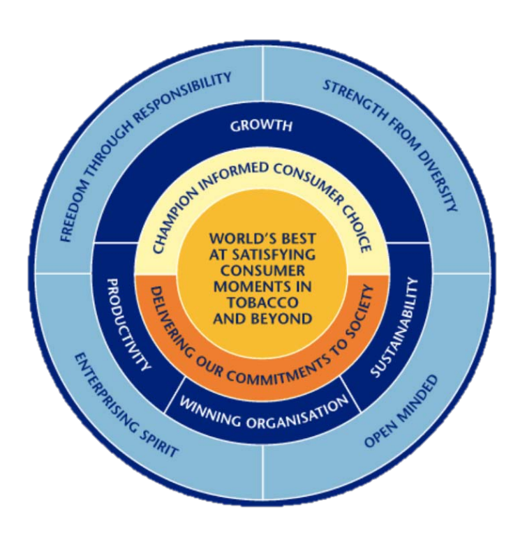
Figure: Vision & Mission of BATB

The second part of their vision – tobacco and beyond – recognizes the strength of the traditional tobacco business and addresses the emerging opportunities they see in next-generation products. There is a great potential business opportunity here with emerging product categories in which they are uniquely trying to succeed.