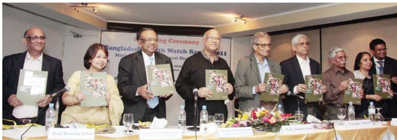
Official Launching Ceremony of BHW's report on Universal Health Coverage