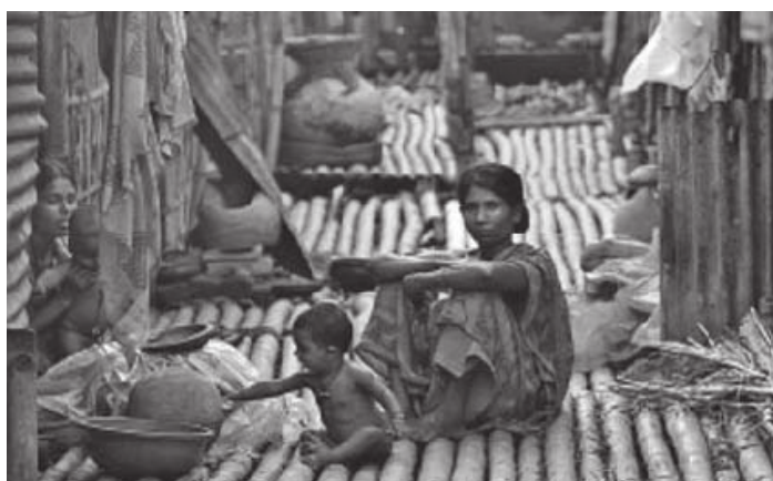
Disadvantaged population at higher risk of impoverishment due to catastrophic OOP health expenditure

Garrett L, Chowdhury AMR, Pablos-Mendez A. All for universal health coverage. Lancet 2009; 474:1294-99.