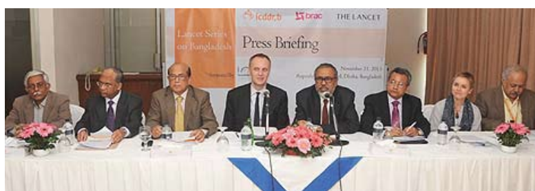
Lancet pre-launch press briefing

commentaries ( http://www.lancet-journals.com/bangladesh ), a perspective ( http://www.thelancet.com/journals/lancet/article/PIIS0140-6736(13)62306-5/fulltext ), and a communication ( http://www.thelancet.com/journals/lancet/article/PIIS0140-6736(13)62394-6/fulltext ). According to The Lancet this six-part Series takes a comprehensive look at one of the "great mysteries of global health", investigating a story not only of "unusual success" but also the challenges that lie ahead as Bangladesh moves towards universal health coverage. In the Call-to-Action, the authors called for a long term HRH strategy and plan, establishing national health insurance, an interoperable health MIS, strengthening ministry of health and family welfare, and establishing a supraministerial council on health for achieving universal health coverage.