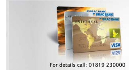
Shop on your BRAC Bank Credit Card and enjoy

4% CASHBACK when you charge at any BRAC Bank POS Machine