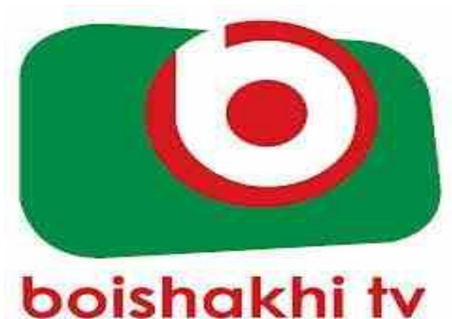
Logo of Boishakhi Television

Boishakhi Television is one of the leading channels of Bangladesh. It is mainly Bengali language digital cable television channel which has English Department also. It broadcasts from Dhaka. It started its journey on the 27th of December, 2005 with the slogan of "Muktijuddher Chetonay" (মুক্তিযুদ্ধের চেতনায়). The channel has faced some technological problems, so it was re-launched in 2010 with revolutionary changes by introducing the latest technical support and new software-based system. It was accompanied by Destiny Group. Now the channel has its own fully state of the art Satellite Earth Station which is used to broadcast digital signal to telecast Apstar 7 satellite whose downlink frequency is 4009 MHz C-Band. It transmits from the Dhaka studio.