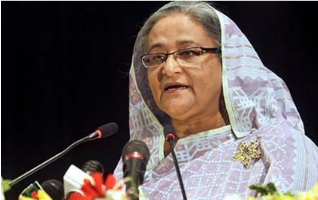
Sheikh Hasina at Haji camp on 6 th September

I had a great experience on reporting during my internship period. Though I have not interviewed people and did not give any PTC, going to the spot and taking notes for the editors was a great experience.