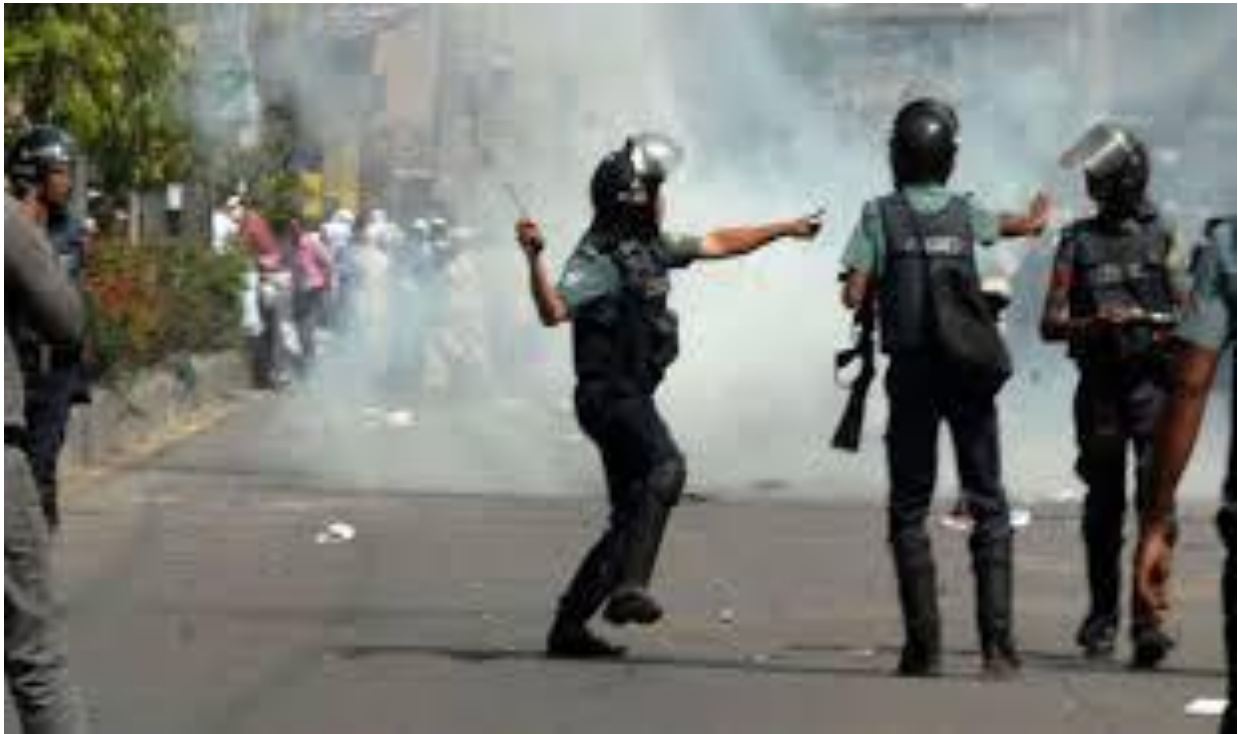
Jamat-Shibir's 2-days long Hartal

news. I gave him the main points of the inauguration speech and told him the details of every point. Then he made news of it. I certainly enjoyed my first experience of reporting news.