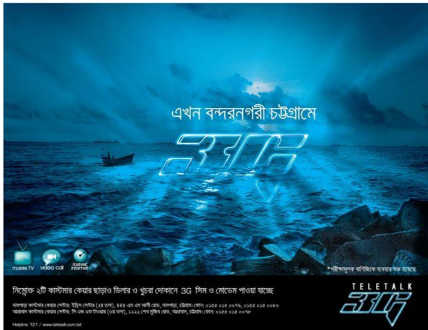
Launching Teletalk 3G in Chittagong press, billboard and pop up ad