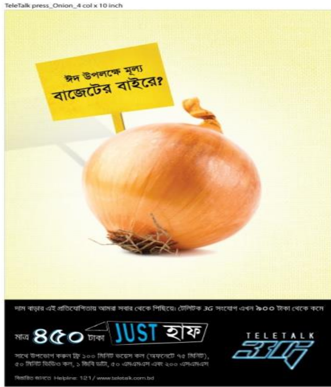
Press advertisement for half price Teletalk 3G sim