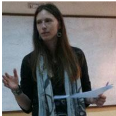
PSDP orientation program on February 14