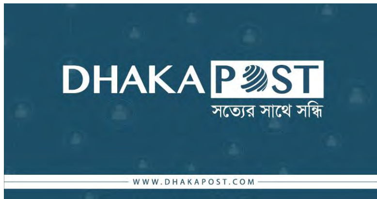
Figure02: Logo of Dhaka POST, For their intended readers, the emblem of Dhaka Post represents truthfulness, devotion, and openness.

This feature editor of the Dhaka Post covers a wide range of topics, including travel, fitness, life style, recreation, professional advice, and sporting. I have been able to discover more about my capacity for writing because to the features era and the wide variety of topics explored in them. The Dhaka Post's plan to reach with young people is optimistic and open to new ideas.