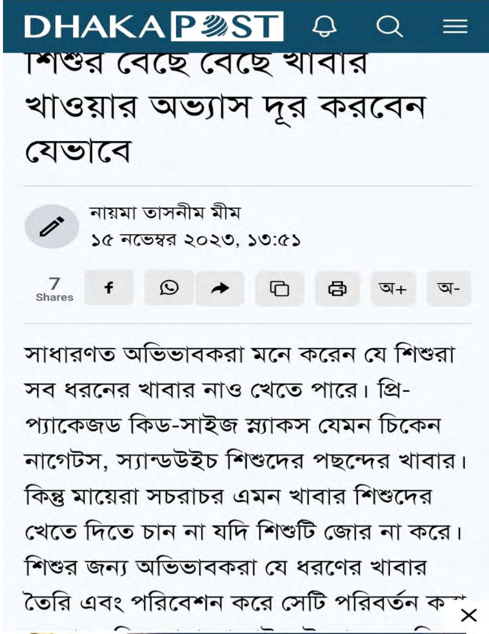
Figure 6: Article on translation

The Bengali term "pre packaged" is unchanged in the text since I believe it's easily recognizable that will be understood among the audience. In contrast, I changed the term