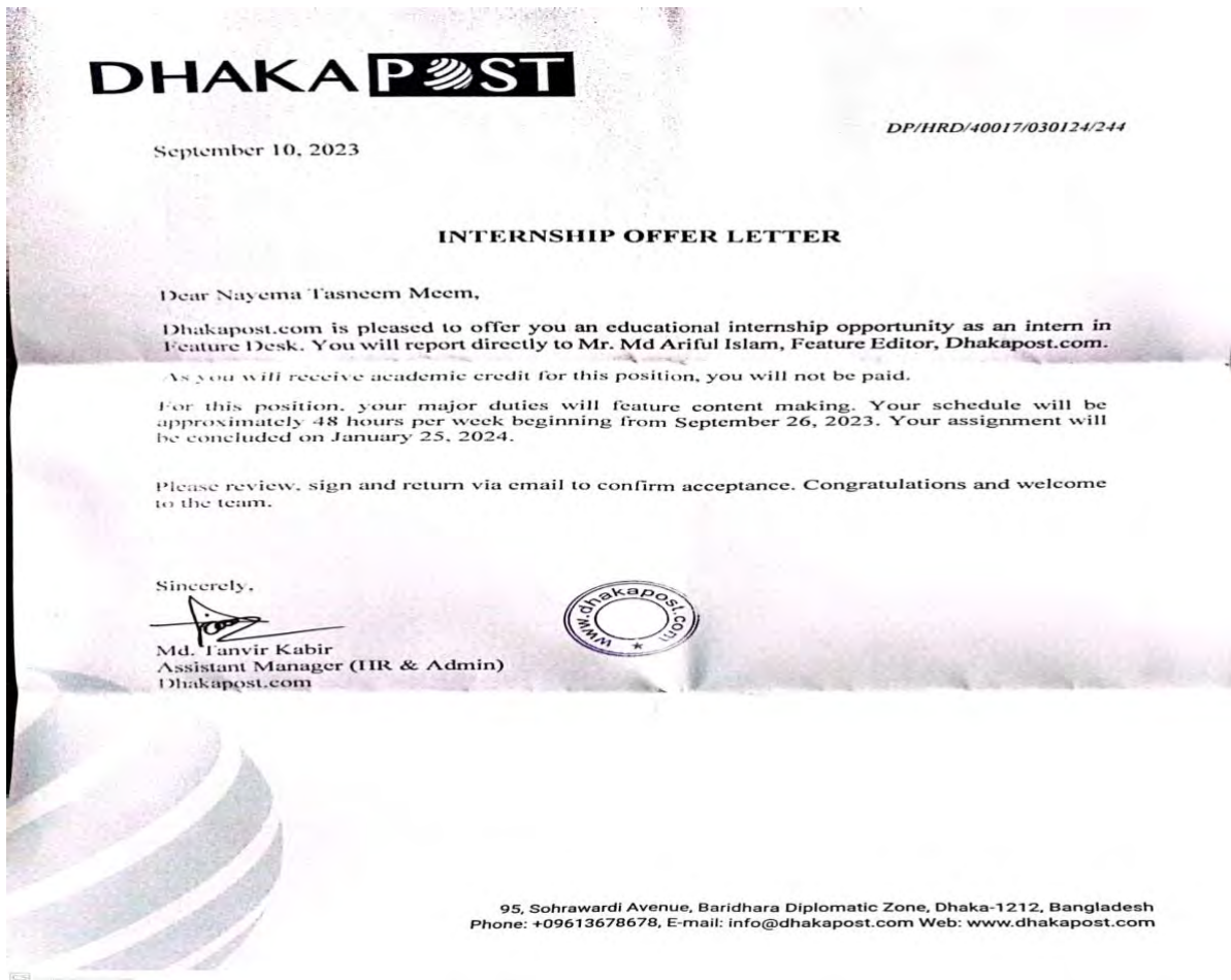
Figure01:Appointment letter at Dhaka Post

exposure in the news industry and helped me expand the realm of writing for newspaper. I was assigned with gathering significant articles from well-known international news websites and translating them into Bengali.