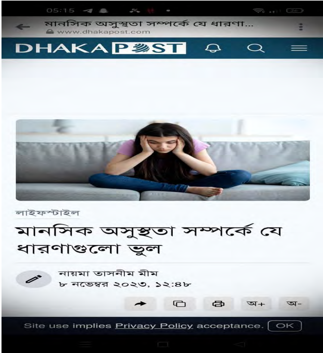
Figure 3: Translating News

In order for this post to be easily understood by all individuals, I need to be very careful with my wording choice.