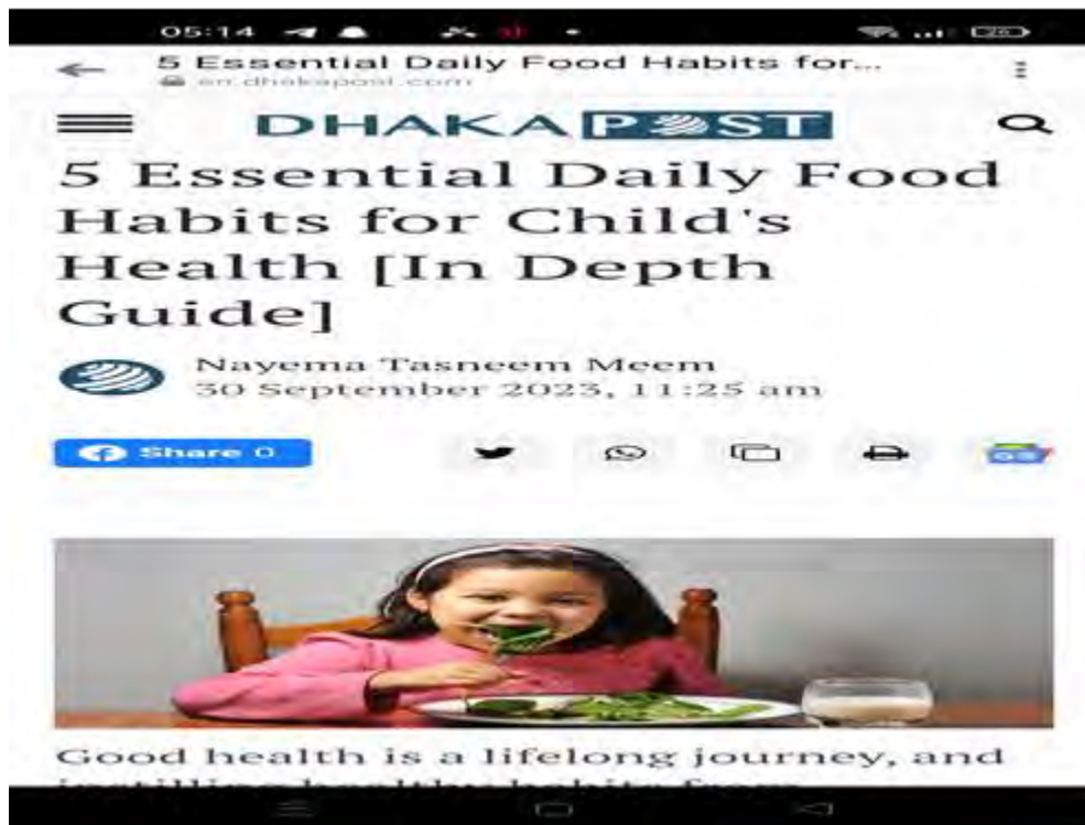
Figure 5: Headline, lifestyle

When putting together news stories, it's important to remember that people are more inclined to click through an article via the internet if it has more real data. I am required to update this article using an SEO-friendly software for the Dhaka Post lifestyle website. After that, I will revise this piece. The ability to use Adobe Photoshop for image manipulation is something else I learn.