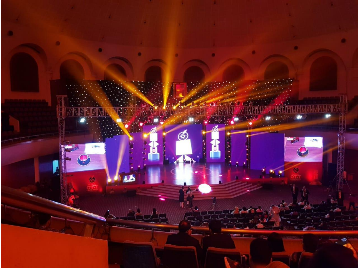
Picture : Blender Choice OTT Awards

employer a detailed report. Despite my prior experience attending several performances and award celebrations, this one stood out as it had a large number of celebrities.