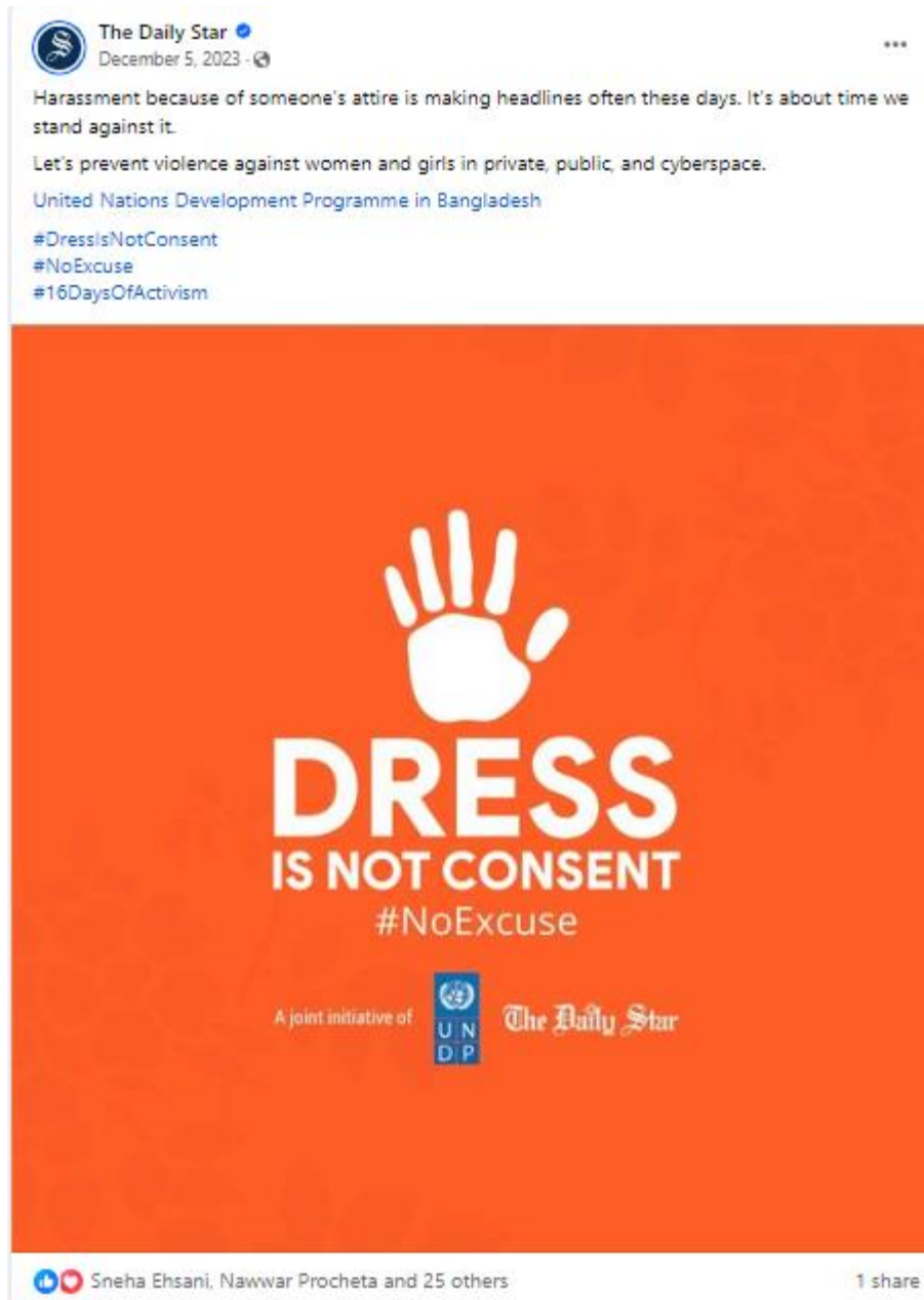
Picture 5 : Copywriting content produced by me while working with the campaign of UNDP