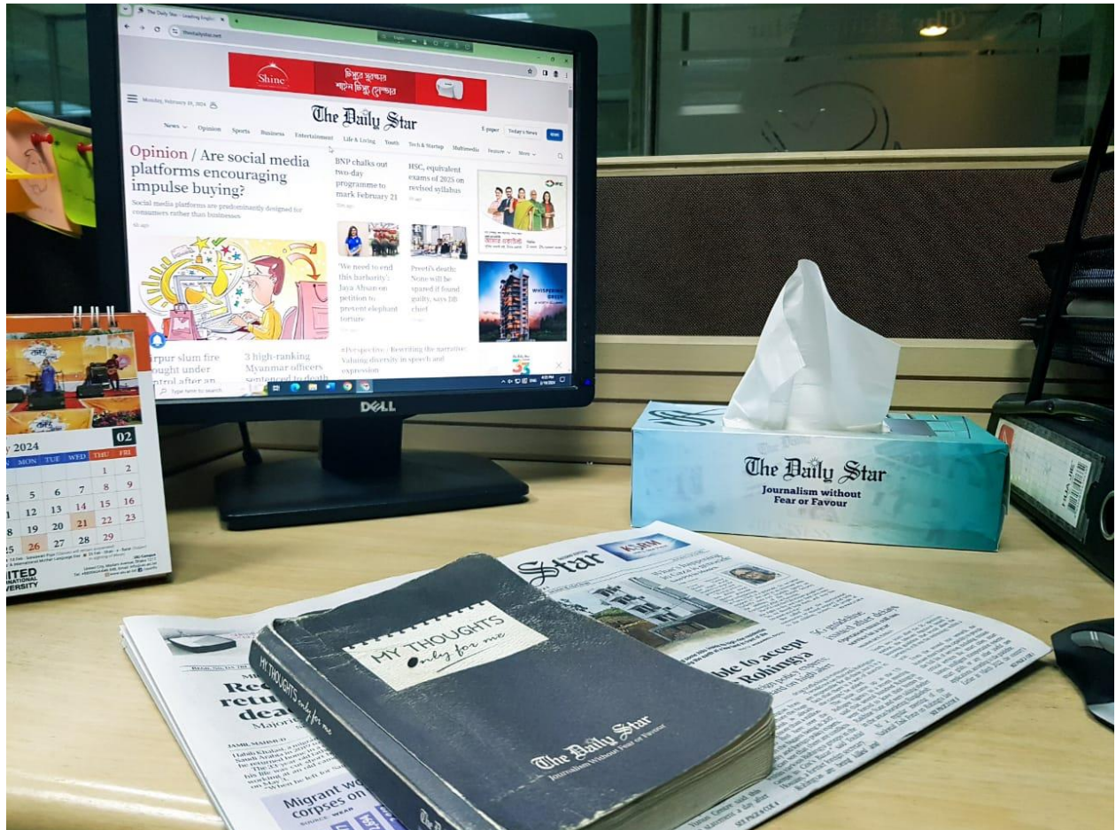
Picture : While Working in the Desk

It was his heartwarming support as well as the happiness he carried with him that made me be not only my adaptation simpler but also be in position to solve the challenges that I had on my