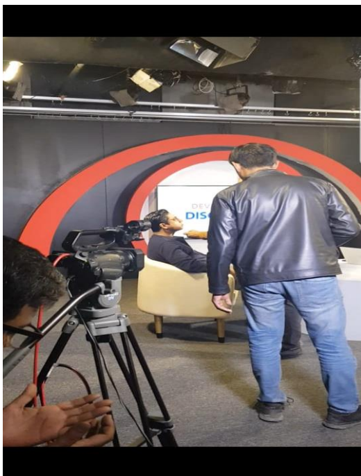
Photo taken by me during Interview process

Over the period of working, I came to know the things that make the story more gripping while I also became better at preparing interviews and conducting conversations using the news value factors. It enabled me to actively participate in a debate on many big issues, such as elections, through insightful interviews that resonated with the audience at many levels by linking theoretical knowledge and the professional field.