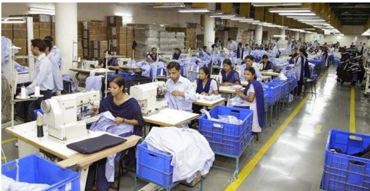
Figure 7: machine layout

After cutting it goes in to the sewing department there are multiple steps for making a t-shirt. Total 14 machine are needed for one t-shirt each operated by different operators. Most important worker among all these workers is the person who is responsible for the shoulder top part of the t-shirt. Full production line depends on him the more expert this person is the more production will increase in the production line. He. Is generally the most experience machine operator of the garments. This process is most time consuming all the back lock happened in this part so the full production line depends on this person. After completing the t-shirt, it goes through multiple check 1st check happens just after swing, in this step main job of the workers are to cut the excesses yarn form the t-shirt.