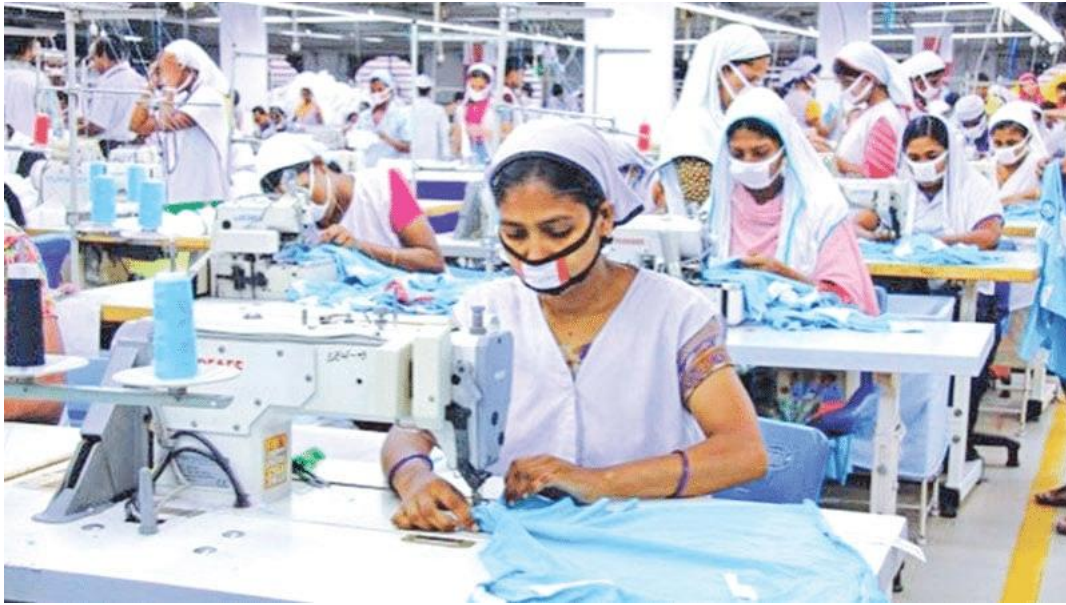
Figure 1: RMG. factory in Bangladesh