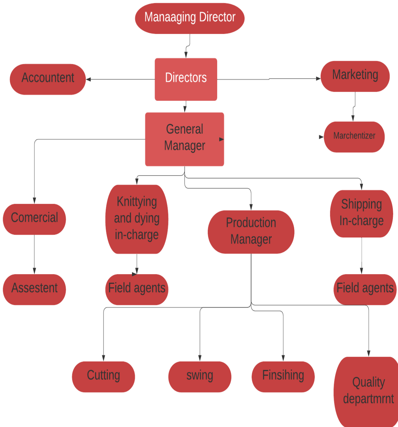
Figure 4: Organization Structure