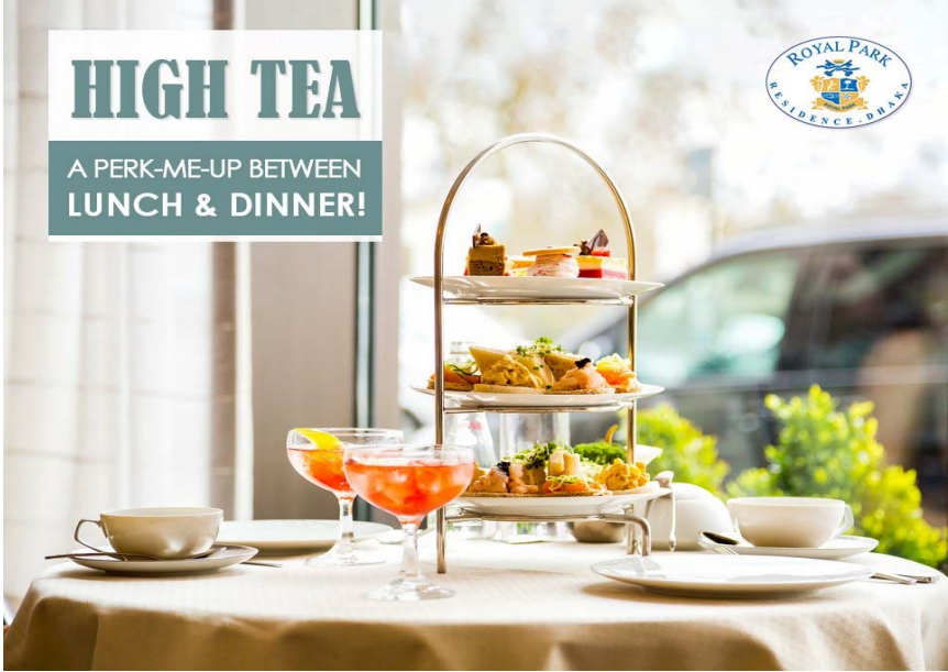
Picture: High Tea Promotion at Royal Park Residence Hotel