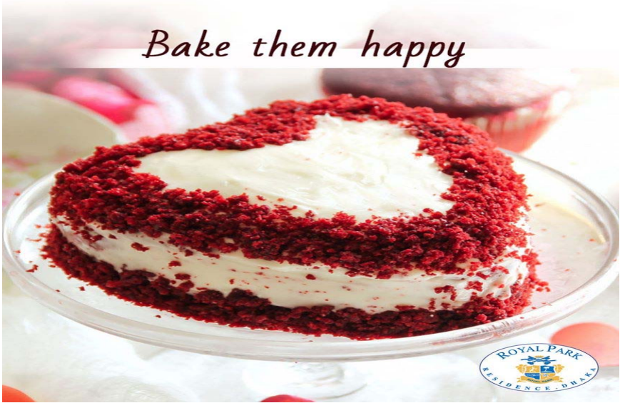
Valentines Promotion at Royal Park Residence Hotel