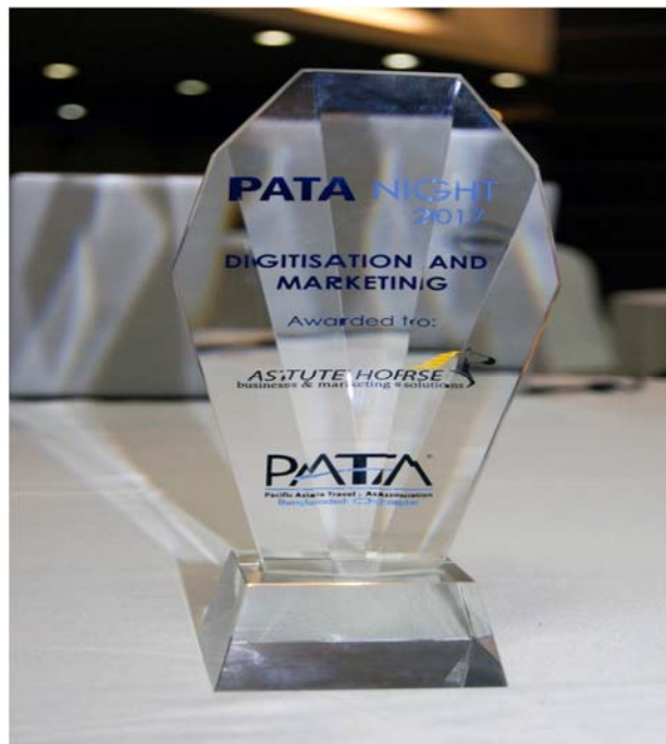
Picture: Astute Horse received Award from PATA