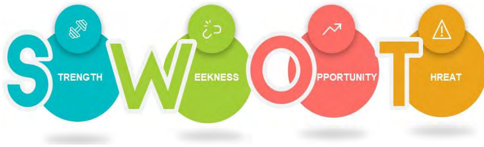
Figure-: Analysis of SWOT