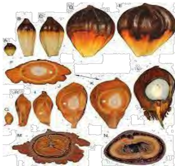
Figure 3: Morphology of Nypa fruit shell (Bobrov et al., 2012)