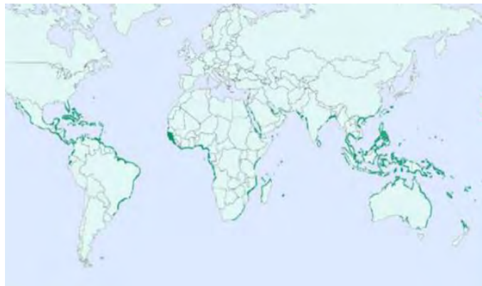
Figure 2: Distribution of Nypa(Dewi Astuti et al., 2020)

It is believed to be native to the regions of Queensland and the Northern Territory in Australia, as well as the Ryukyu Islands, Bangladesh, India, Sri Lanka, the Andaman and Nicobar Islands, Myanmar, Cambodia, Thailand, Vietnam, Borneo, Java, Maluku, Malaysia, Singapore, the Philippines, Sulawesi, Sumatra, the Bismarck Archipelago, New Guinea, Solomon Islands, Caroline Islands, and Australia. It appears to have been naturalised in Nigeria, the Society Islands of French Polynesia, the Mariana Islands, Panama, and Trinidad. Iriomote Island, off the coast of Japan, and neighbouring Uchibanari Island comprise the distribution's northernmost limit. (Dewi Astuti et al., 2020)