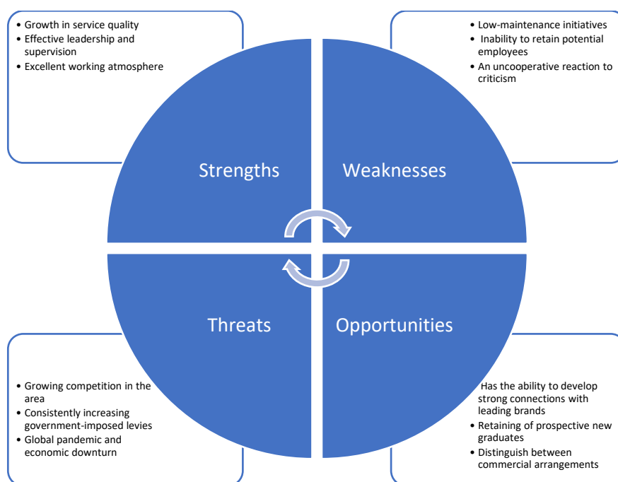
Table 1: SWOT Analysis of X Solutions Ltd.