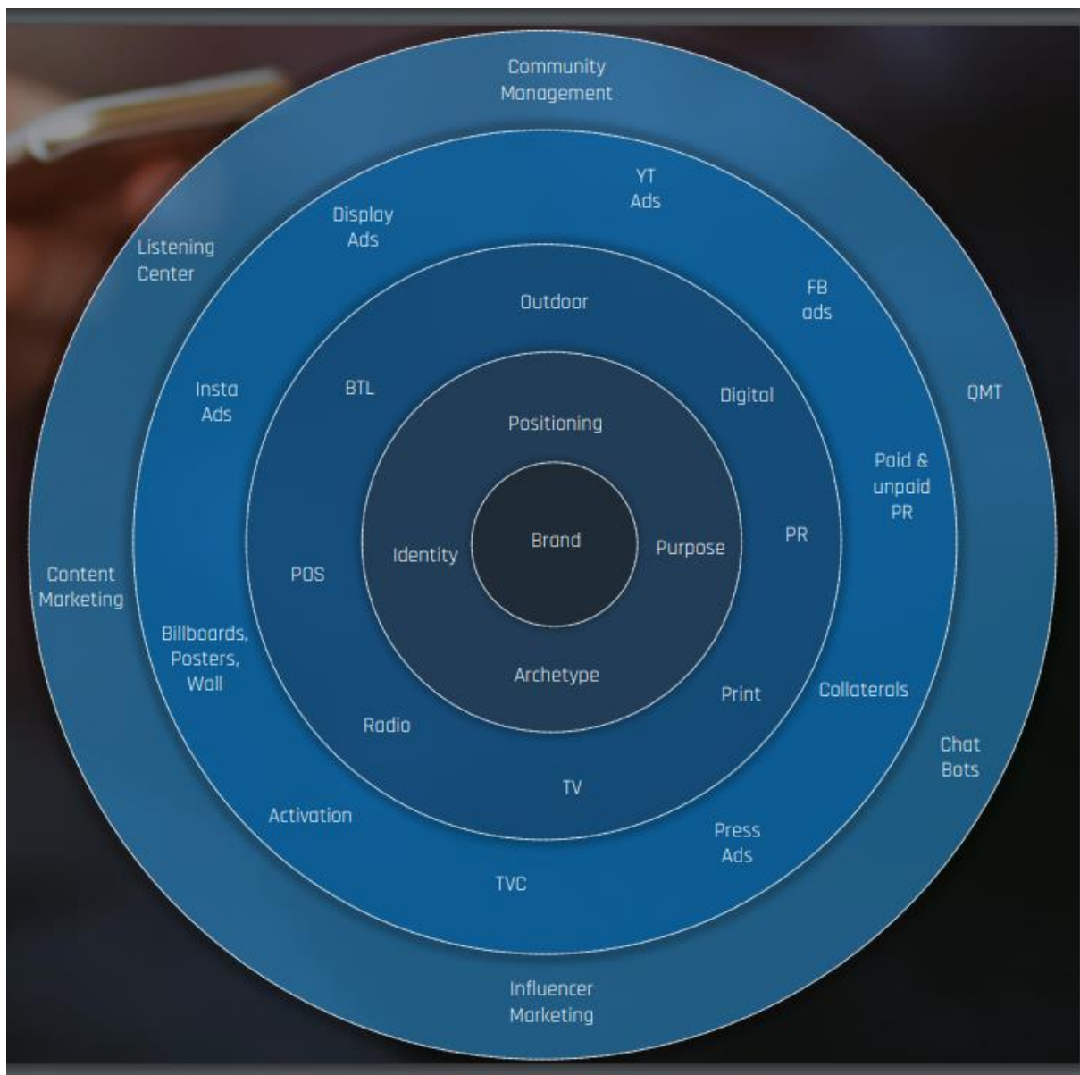
Figure 2: 360 Degree of X Solutions Ltd