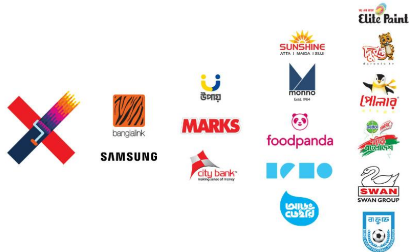
Figure 1: X Solution Clients