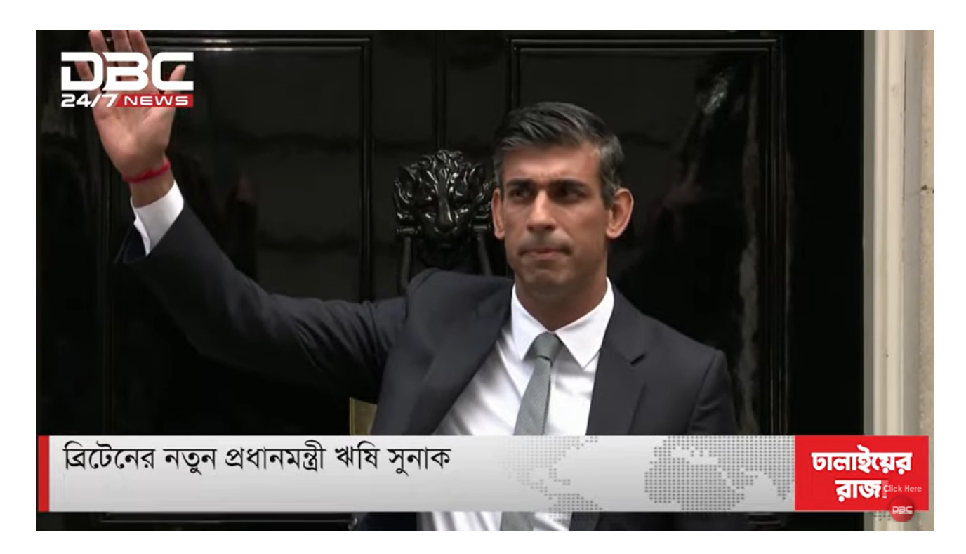
Figure 12: News on Rishi Sunak

got new updates on these issues. It was necessary to give updates to the audience about these matters.