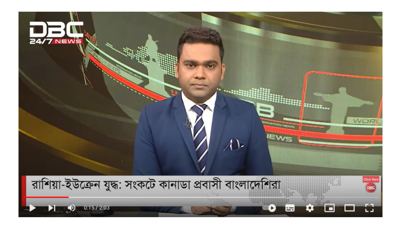
Figure 9: Package on Ukraine and Russia War

In figure number 8, you can see that the duration of this video is 2 minutes. As I mentioned that a package should not extend above 3 minutes because the strategy is to hold viewers attention. The most concerning part was to write the package and to do research. After reading it, I had to choose some reader friendly words and write the script in very few sentences. While writing a script for a package, I should keep in mind that there will be video sound and speech between the footage, and that the reporter should be able to finish his speech with pauses.