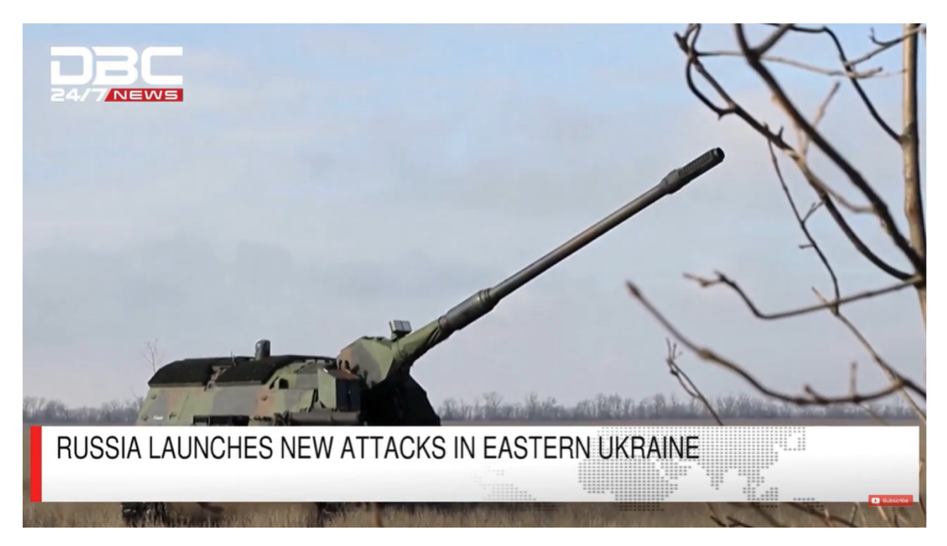
Figure 11: OOV

news with the help of my English desk senior's which was about the Russia and Ukraine war. They enlightened me with some important points which helped me to highlight those in the script.