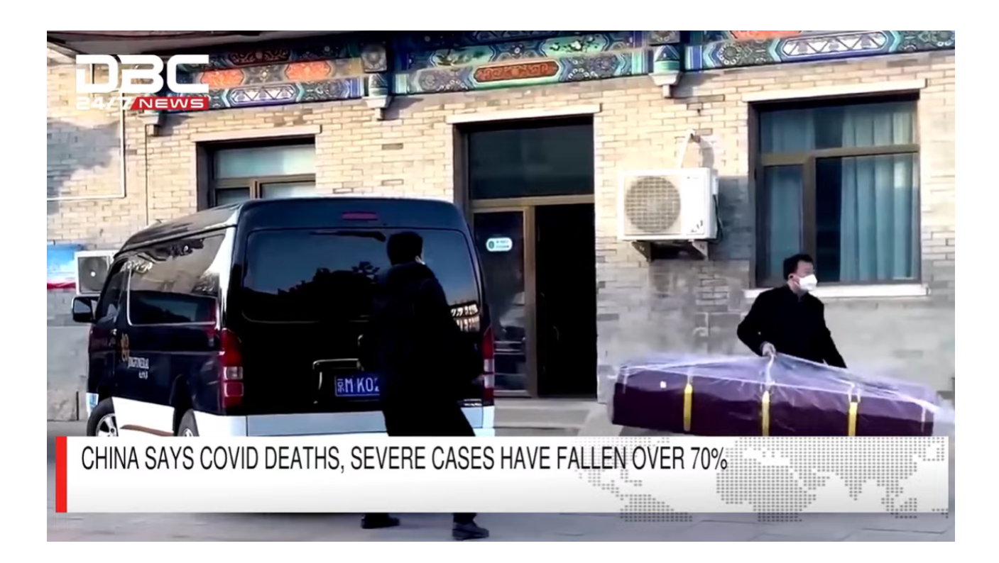
Figure 4: News on COVID-19