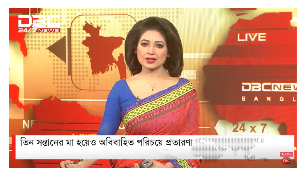
Figure 14: News on Fraud Woman

Oddity is a different form of news which does not appear everyday. This type of news gets more attention than the usual one. The reason behind this may be the interest of people and they enjoy different news to watch and discuss about it later with their closed ones. During my internship I have got a local story to cover. As I have said, my supervisor wanted me to have knowledge about the entire newsroom. So, one of my senior colleagues and I worked on a local story which caught the audience's attention. The story was about a woman who is a fraud and did illegal things to her temporary partners.