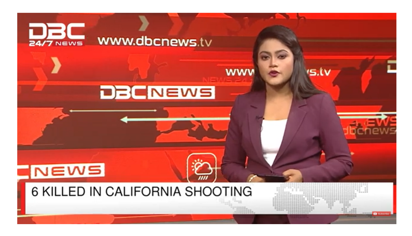
Figure 10: Package on 6 killed in California shooting

This package was very difficult for me to write as it is a very sensitive topic but my colleagues helped me throughout the time and I got to learn so many things from them. For example, how they express a situation with simple words and sentences.