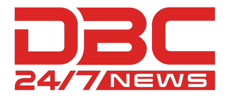
Figure 1: Logo of DBC NEWS

Bangladesh which provides service of 24-hour live news. It is mainly Bengali language digital cable television channel which has an English Department also. It started its journey on the 15th of June, 2016. About three months the channel was on test and on 21th of September, 2016 it officially went on-air. The channel has its own fully Earth Station which is used to broadcast digital signal to telecast Apstar 7 satellite whose downlink frequency is 4092 MHz.5 It transmits from its studio in Dhaka, Bangladesh and the satellite has a huge coverage area across the country. The logos of the channel have been designed by Sadek Ahmed.