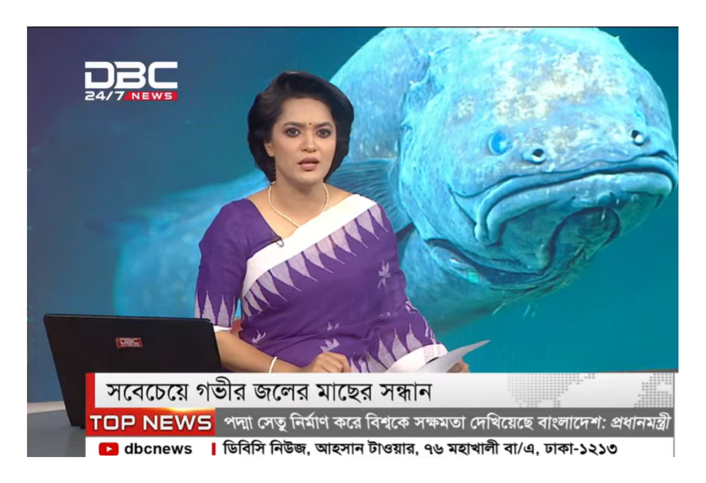
Figure 7: Super/Headline

I also observed senior writers to learn how to create headlines. Organizing news in a more efficient manner, as well as scrolling techniques. To create captivating headlines, I must first examine the most effective approach. I followed the example of my seniors. They were quite helpful in this regard. There are certain guidelines to follow while crafting headlines. I imitated how my seniors made headlines while keeping in mind the norms. Every piece of news must be presented in an orderly fashion. No matter how smart the writing, if the news is not arranged correctly, it will be difficult for readers to follow. I learned how to organize the news so that people can understand the proper order of each story. Besides, scrolling is an important function on the television screen. For time limitation not every news can be reported promptly. There are constantly breaking news stories that cannot be censored in the news. Therefore, scrolling enables individuals to be aware of