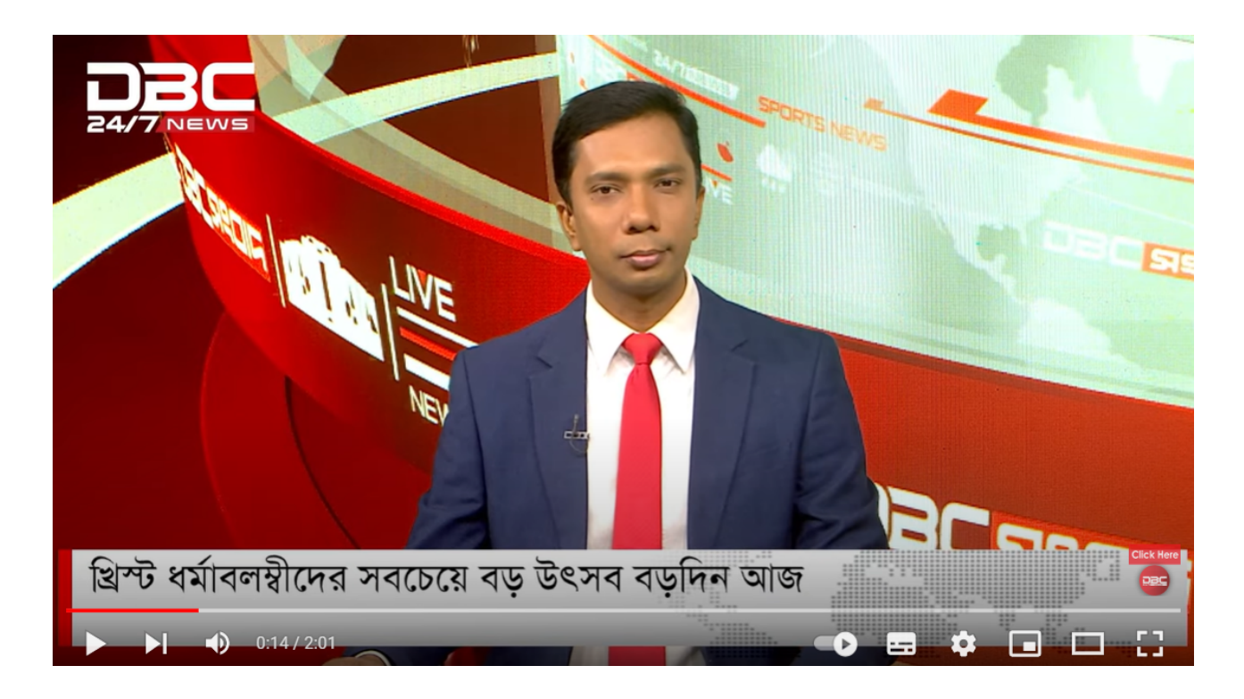
Figure 8: Package on Christmas

Package news is an innovative way to convey news to the audience and the longest type of news storytelling. It is a kind of news with more detail that has a form of storytelling, characters, entertainment value and facts that deliver in-depth coverage of news by investigating. It includes the most recent and significant incidents on innovation, science, showbiz, trends and other issues of interest throughout the world. A news package usually runs for 1:30-3:00 minutes in length.