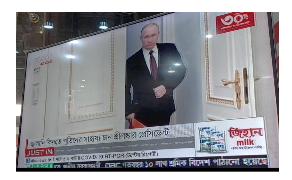
Figure 2: News stories shown in live television (1)

Here are the news stories I worked on that are being shown on live television. I clicked them over my cellphone while working in the organization.