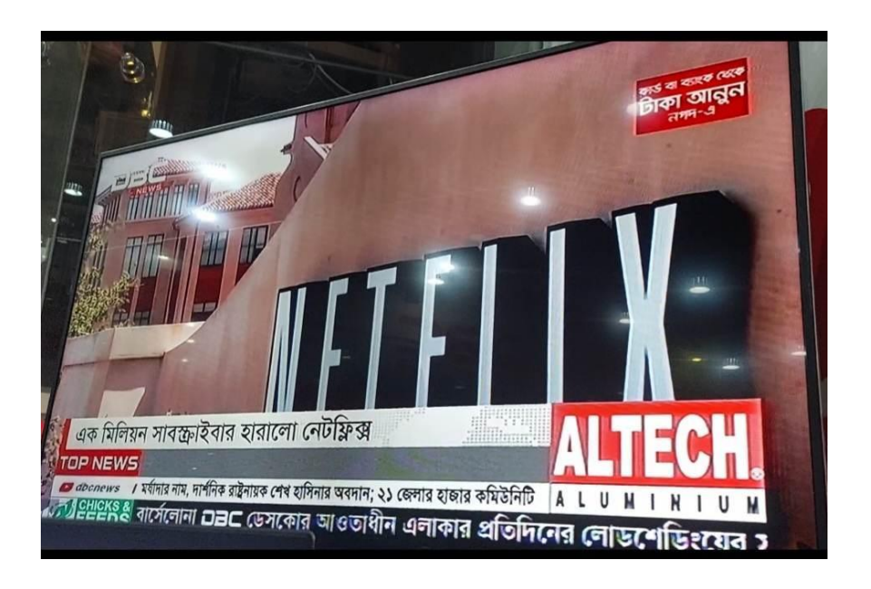
Figure 3: News stories shown in live television (2)