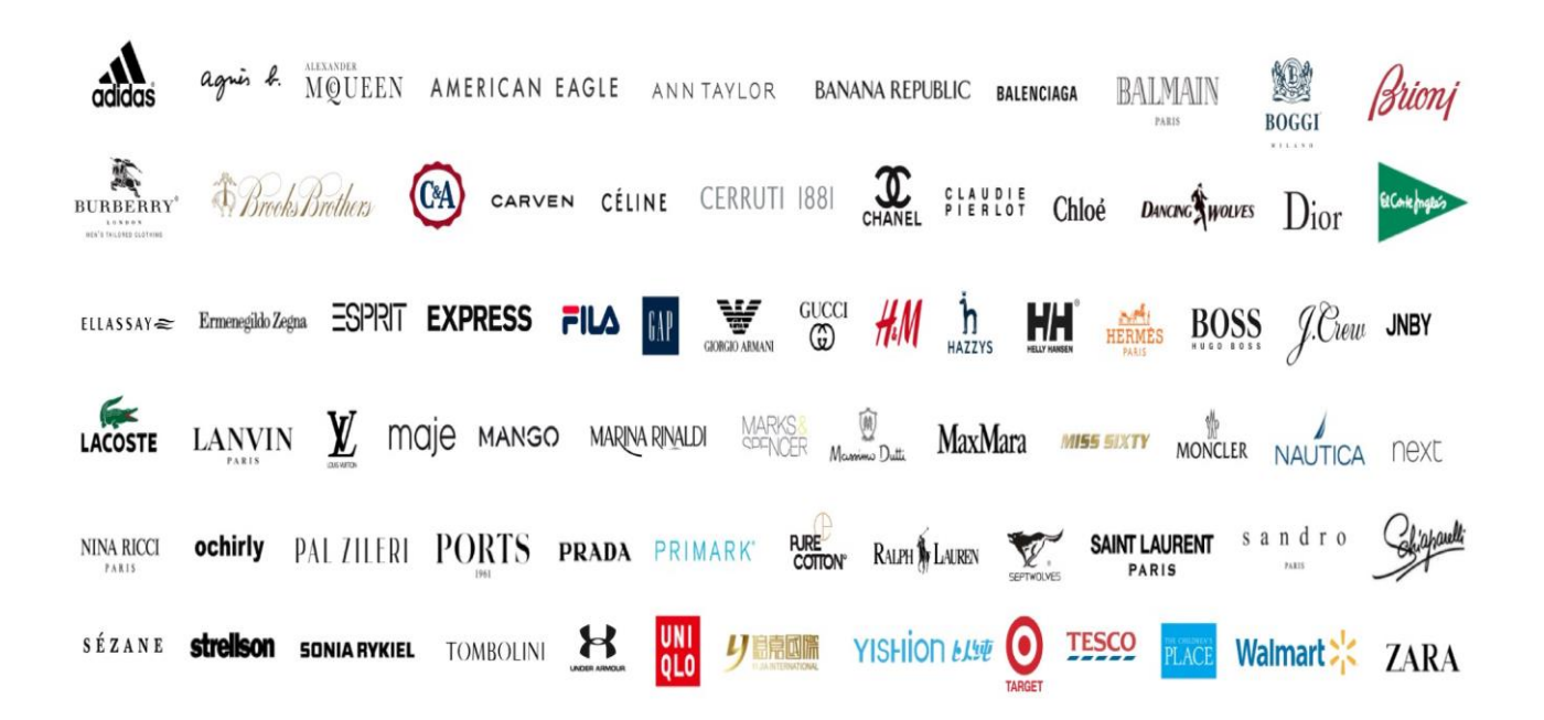
Fig3.0: Loyal Clients working with Chargeurs PCC for long period of time.