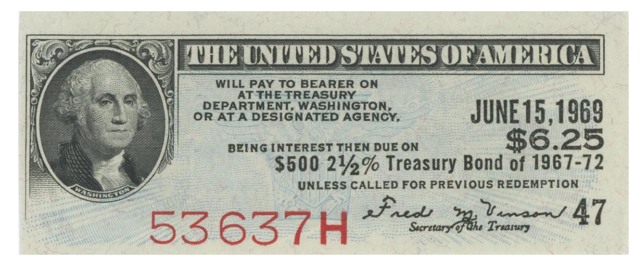
Figure 2.2: Coupon Bond

It is possible to trade bonds, and their price is determined by both the interest rate on the bond market for an equally risky instrument and the coupon they have. By facilitating long-term funding flows between surplus and deficit units, bonds play a key part in an economy. Bonds act as loans where buyer holders of bonds are lenders and the issuer is borrowers and the coupons are interest.