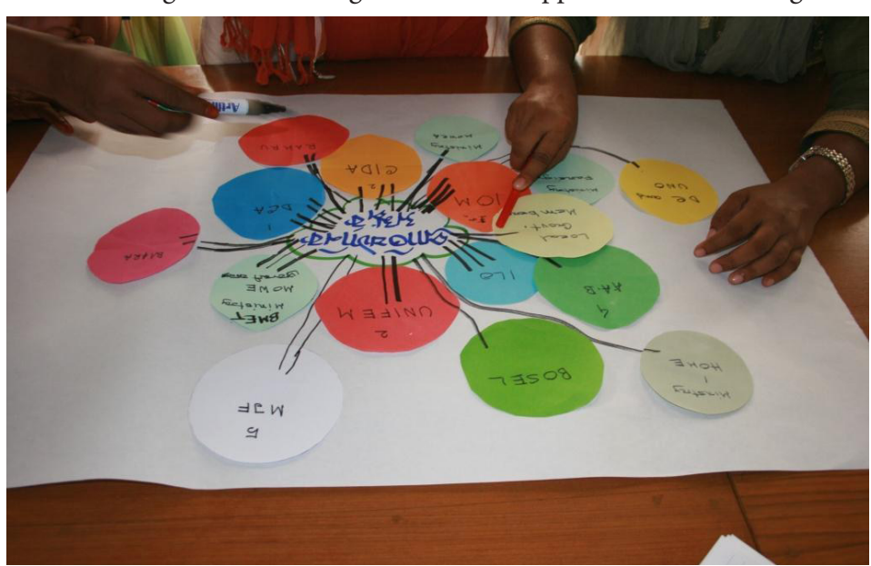
Bangladesh Ovibashi Mohila Sramik Association Workshop help 5 October 2009

As mentioned above all organisations identify partnerships as an important resource. These were seen as sources of information (e.g. War on Want for Karmojibi Nari), and those which provided platforms for mobilisation at international, regional or national levels. Partnerships allowed the organisations to establish and build their reputations at various levels. Forming alliances and coalitions is seen as an important strategy for constituency building, because it enables the organisations to mobilise a large number of organisations to support their cause or agenda.