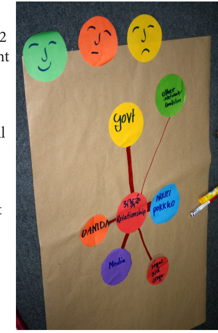
Diagram from the Doorbar Network Workshop held 5 September 2009

Sources of funding for NGOs have evolved over the years. It started primarily with small international charities and foundations and larger INGOs entered the scene later. International foundations such as Ford Foundation and The Asia Foundation played an important role till the 1990s. Strategies of INGOs such as Oxfam GB, AAB, and CARE also evolved from direct implementation in the 1970s, to increasingly working through partnerships with local NGOs. However, their access to funding