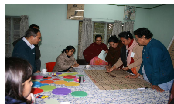
Banchte Shekha Workshop held on 20 October 2010

The organisations pointed out that there was an inter-generational difference in how members perceived voluntarism. While voluntarism played a key role in developing the organisation, younger members have a more professional approach towards investing their time. The reasons for this difference are illustrated by examples on BNWLA and Doorbar Network (see Text Box 3).