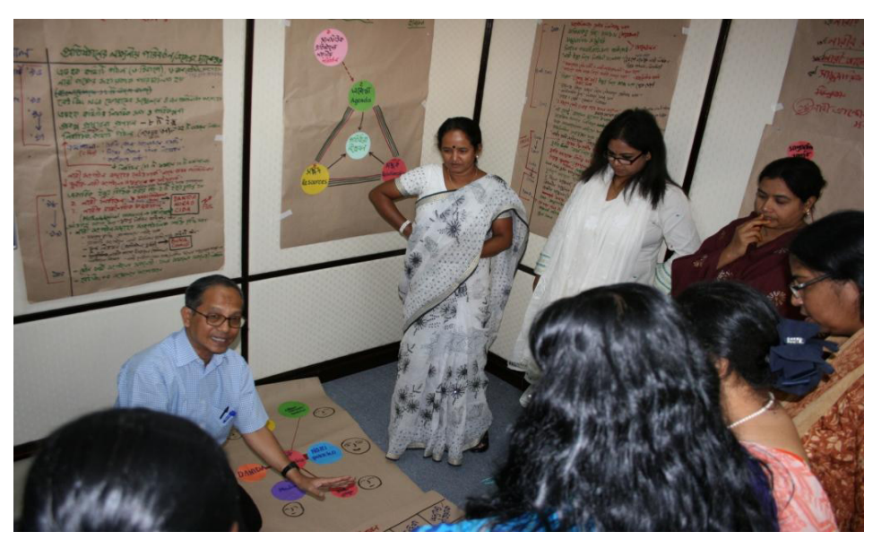
Doorbar Network Workshop held on 5 September 2009

We saw that resources for NGOs, CSOs and WROs separately are shrinking. Donors that had formerly provided support are being obliged to downsize their offices and staffing, and harmonise programmes, and increase support to the government. Funding for NGOs services and programmes is being allocated to large government programmes, for which NGOs have to compete and bid. Development agencies emphasise they are committed to gender equity and women's empowerment, but without allocating separate resources for this. This section uses information from interviews with staff in the donor agencies that funded the case-study organisations. We explore their own perspectives on their role in supporting WROs and the role of resources. Annex 1 maps the donors who had supported the case-study organisations. The themes of the interviews were mentioned in Section 1. Table 2 below is a summary of the interviews with the agencies and their key characteristics.