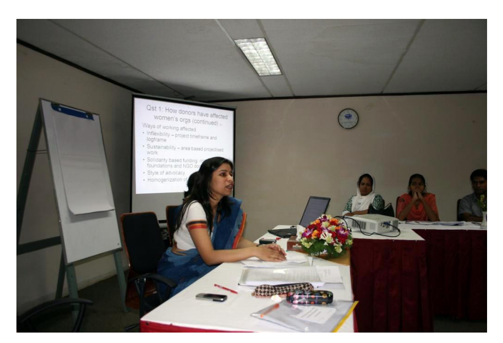
Validation Workshop held on 30 August 2010 with the case-study organisations and 31 August 2010 with the donor organisations

Most WROs have a different standing, legitimacy and identity from other development NGOs. They are a recognised and valued part of society. It is this as well as their commitment to establish gender equity and creativity in resource mobilisation that may help them tide over the constraints of reduced external funds and encourage different forms of mobilisation and sustainability.