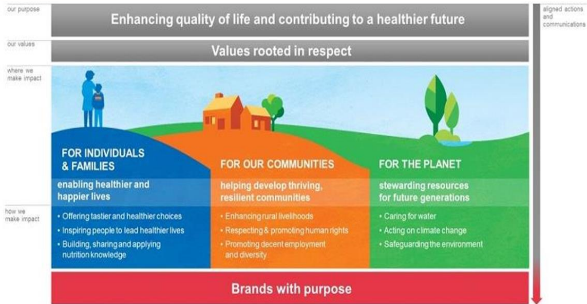
Fig: Outline of Nestlé Purpose and Values