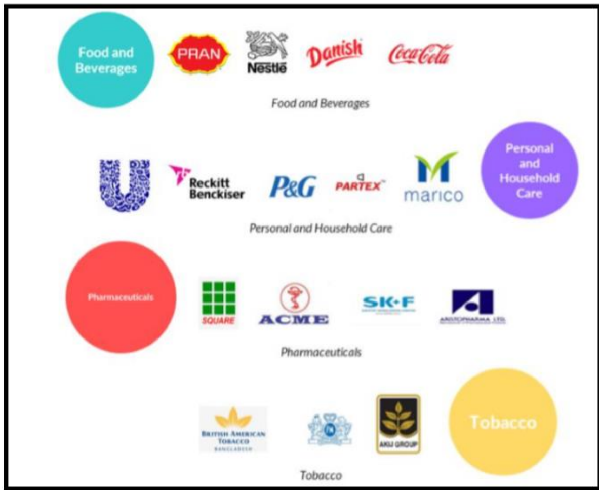
Figure: An image of different FMCG company logos in Bangladesh

biscuits, coffee & tea, baby foods, tobacco, soft-drinks and others. Personal Care industry includes all the items which are for individual care such as cosmetics, perfume, toiletries products and other similar products. Household products are the items valuable to preserve the house like cleaning and beautifying. Sprays or room scents, detergent, soap, liquid detergents are such products. Some noteworthy companies that are leading the FMCG industry are Unilever, Nestlé, PRAN, ACI, Marico and many more. A visual of the companies leading FMCG industry are shown below -