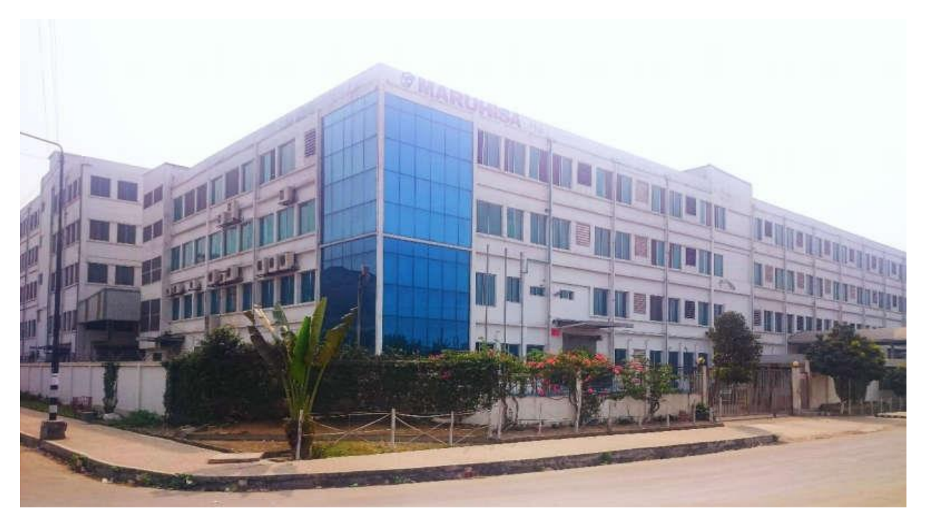
Photo: Maruhisa Pacific Co., Ltd in AEPZ, Bangladesh (Source: http://www.maruhisa-pacific.com/about/index.php)

In Bangladesh. This factory is located at Adamjee Export Processing Zone. The address of this company is at: Plot No: 118-121, Adamjee EPZ, Siddhirganj, Narayanganj. Recently we planned to increase their production capacity. After successfully completing procedure, this factory got 2 new plots 218-219. Our corporate head office is located at Japan. The address of corporate head office is at: 72, Saita Muya-cho, Naruto-city, Tokushima 772-8508, Japan.