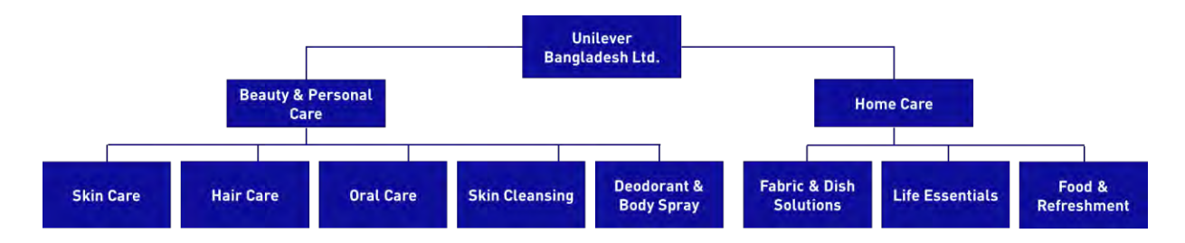
Figure: 1.2: Unilever's Product Category

Unilever Bangladesh Limited is currently competing in the market with 6 broad product category, under each category there are several products. The product category of Unilever Bangladesh Limited is following