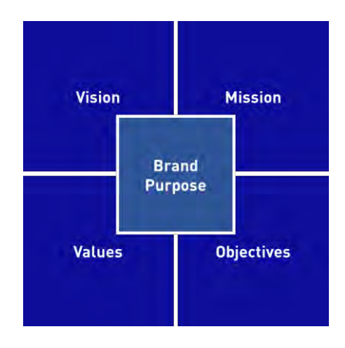
Figure: 5.1: Brand Purposes