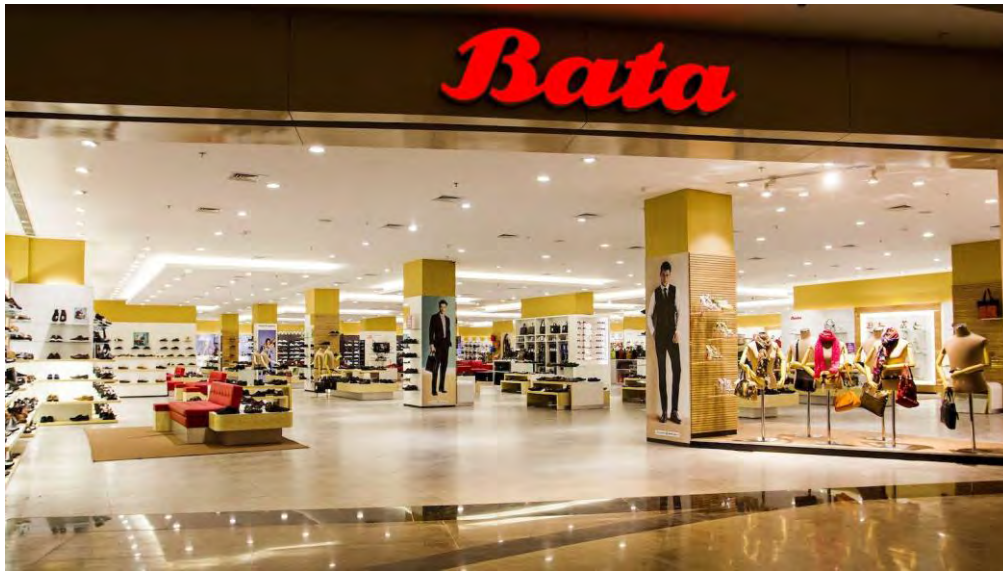
Fig. Bata New Store at Gulshan-2

second highest expenditures incurred for new retail stores. This shows how much Bata emphasizes on visual merchandising and store improvement. With every new product lines and stock, merchandisers change the outlook of the shelves and make it a new experience every time for customers.