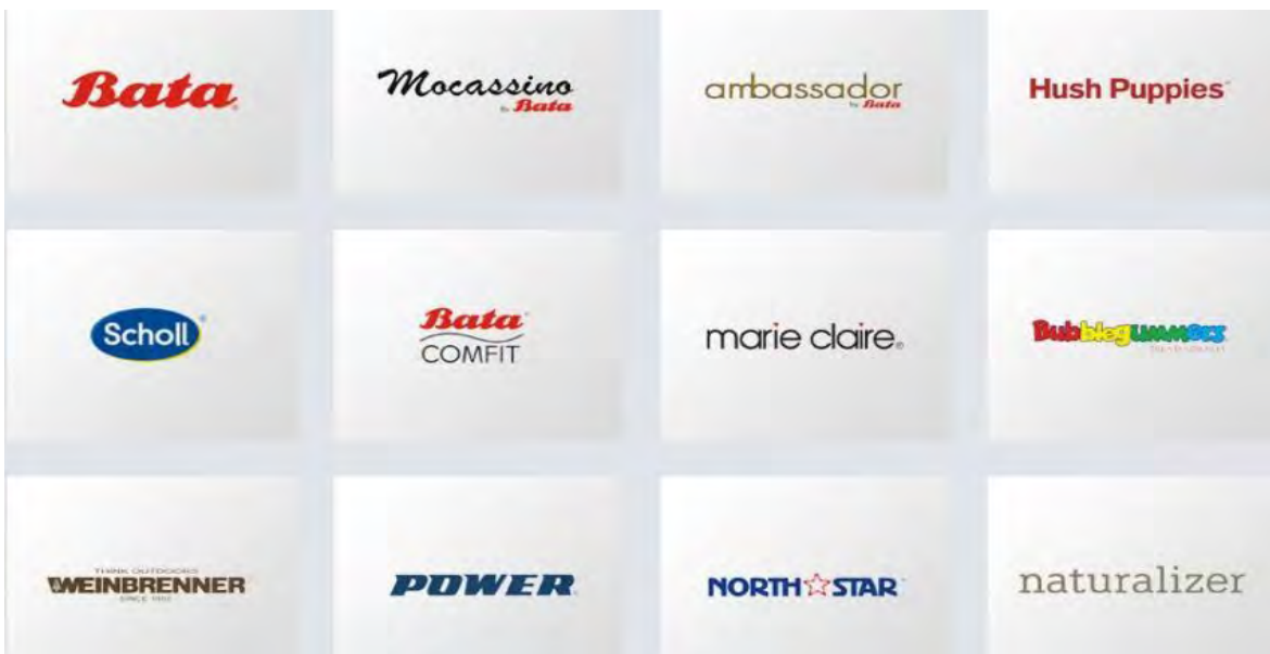
Fig. Brands of Bata Bangladesh

Bata Bangladesh has currently more than 12 brands including Bata's own merchandises. There are few brands that are locally produced in Tongi and Dhamrai plants, some are outsourced to other native vendors, but majority of the brands mentioned below are imported from South – eastern countries. The brands are segmented gender wise and priced according to various income-groups. Among the brands, Ambassador, Hush Puppies and Comfit are specially made for white collar people who seek comfortable shoes with good-looking design barring the price range. Power and North Star are the most profitable brands of Bata as they serve a wider segment of customers unlike other brands. These shoes give consumers a cozy touch along with a sporty look. Meanwhile, Marie Claire, Scholl and Naturalizer brands are dedicated for women footwear and Bubblegummers and B-First are for school going kids. Furthermore, Bata is the sole authorized importer of merchandises of both Nike and Adidas in Bangladesh.