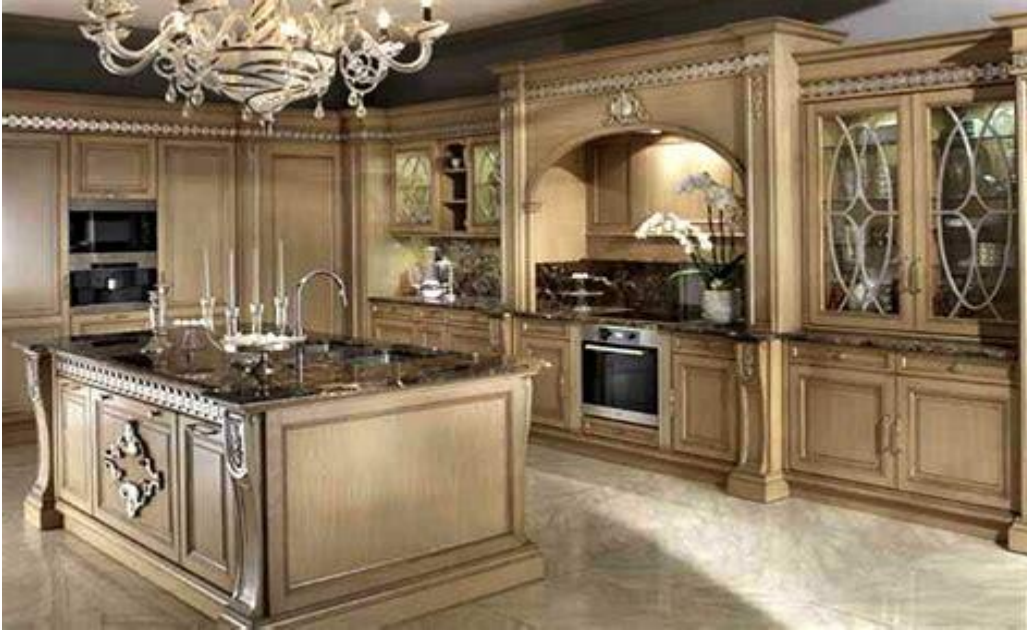
Figure 2: Kitchen Designs Inside Monaco Palace Kitchens

On 27 th July in 2018, I wrote a Package (PKG) on a donkey preservation park in UK where donkeys are used as the source of guests' entertainment. Anyone who buys a ticket can be a guest in that park. The guests can feed donkeys, play with them or explore the park with them. This exceptional park is a great place for animal lovers. Oddity adds uniqueness in the list of news items. Not only does it gain the attention of the viewers, it also grabs their interest. It adds diversity in the category of news items.