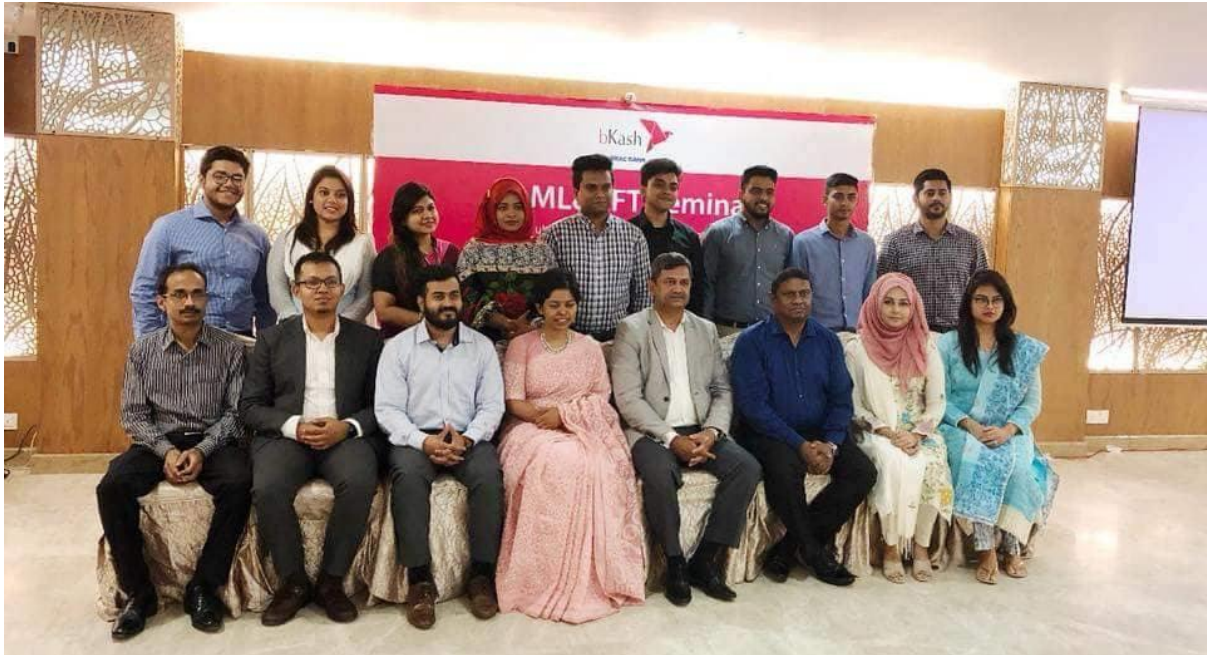
Figure: Attendees of the AML & CFT Seminar