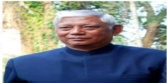
Fig. 12: Obituaries