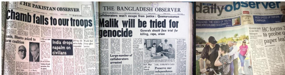
Fig.1: The front page of The Pakistan Observer , The Bangladesh Observer and The Daily Observer .

However, there are two medium of news that The Daily Observer provided, one is Observer Online Desk and other one is Printed Desk . Furthermore, Printed Desk contains with 11 sections with 20 pages like: Front page where includes high priority news, then miscellaneous, city news, foreign news, editorial, op-ed, countryside, news, art & culture, health and nutrition, sports and business. Additionally, Online News Desk is to provide updated news that happen several things in a day. All type of above sections is included in online news side in order to update news in time as it takes time to post news in the printed newspaper. Among others, Life & Style, Observer Tech, Women's' own, Law & Justice, Young Observer, Book Review, Literature, Eid Magazine are also available in Observer Online Desk . Through these, The Daily Observer gains its highest popularity.