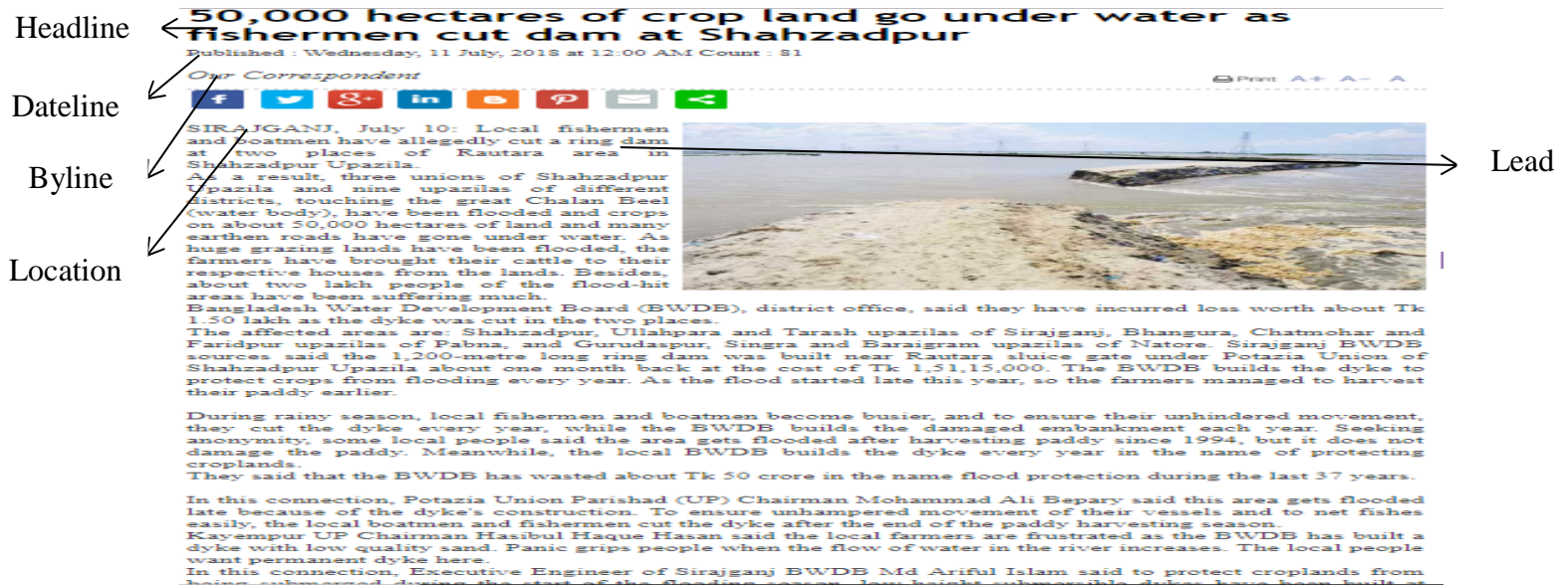
Fig. 7: Identification of terms of the countryside news