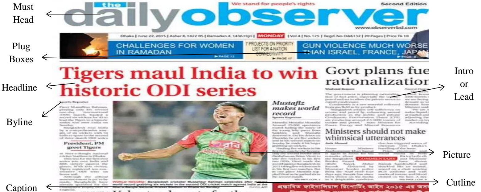
Fig. 6: Identification of terms of the newspaper

Source: Person, record, document or event that provides their information for the story.