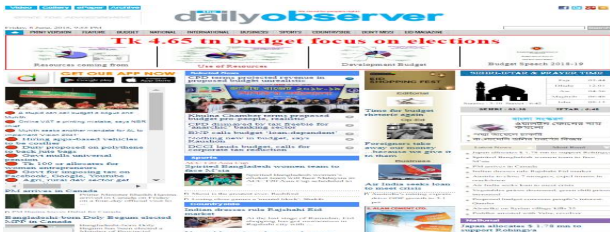
Fig. 2: The front page of Observer Online Desk