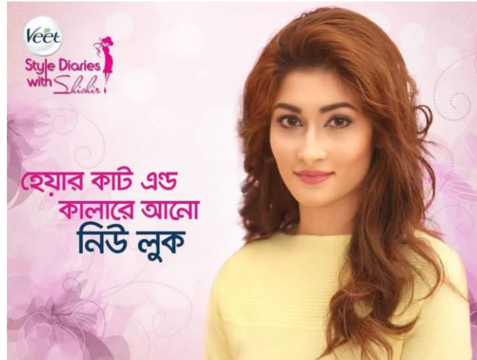
Illustration 3: Static post of Veet Bangladesh, 2017

video. And these post copies and creative copies we have to write according to our client choice. Different brand language is different. Client's preferences are also difference.