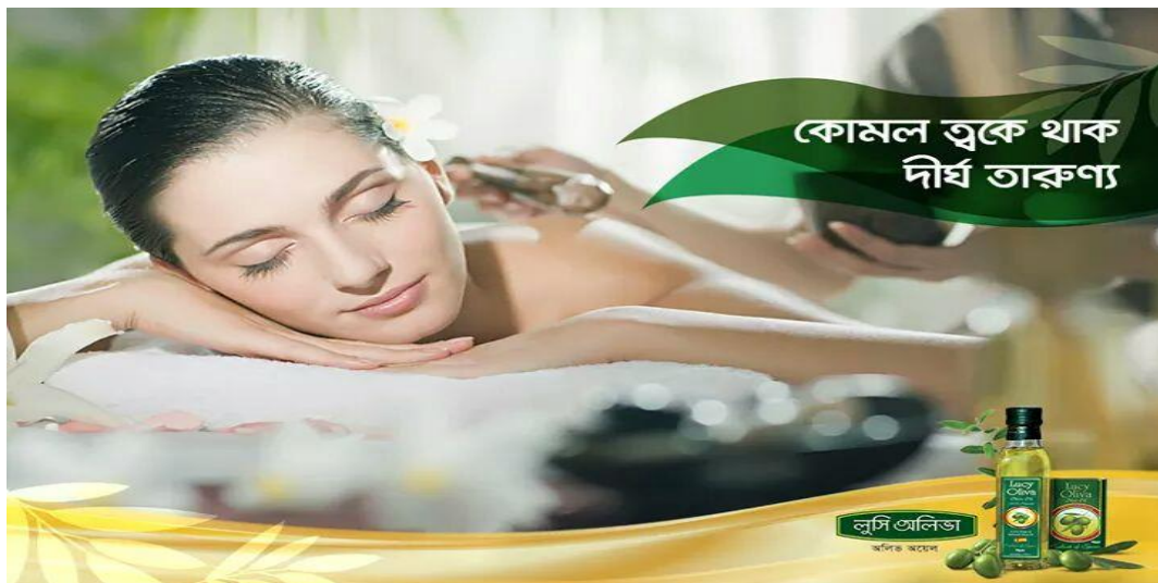
Illustration 6: Static post of Lucy Oliva Olive Oil, 2017

Also, being a part of content team I was a part of ad making. I was in the ideation to ad making. It was really a very interesting and also big opportunity of learning. First time I was very astonished, and also very challenging that I am a part of TV advertising. It was an aspiration to work in advertising industry, indeed a powerful medium.