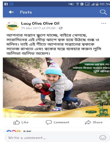
Illustration 7: Regular post of Lucy Oliva Olive Oil, 2017

This was a promotional post, before winter. Promotional post actually goes with seasons, special days, events or for campaigning. Before winter, these promotional posts were for attracting people to buy “Lucy Oliva Olive Oil”, in this winter. So, in my post I had to focus why people can buy this product, how it can serve to the customers’ needs. Posts always tried to be like that, people can find their solution, what they want, how beneficial for the customers etc.