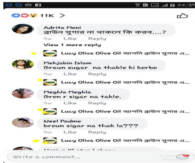
Illustration 8: Comment of the viewers in the web page of Lucy Oliva Olive Oil, 2017

Different customers had different queries regarding the posts, products. They inbox to the page, and we the client servicing people were replying those queries. Also customers did comments on the web pages, on the posts and I had to say thanks or had to reply if they had any particular query.