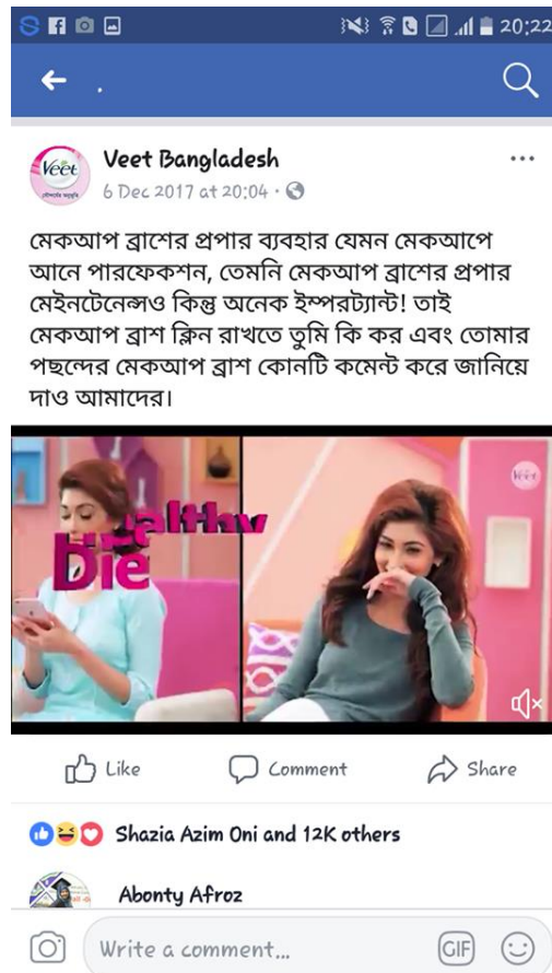
Illustration 2: Teaser post of Veet Bangladesh, 2017

The language of different brands is different. Like, Veet clients always like trendy words, because this brand's Target audience was the youth girls' groups. And I faced some problems during writing copies for Veet. I wrote copies where sometimes the English and Bengali were mixed.