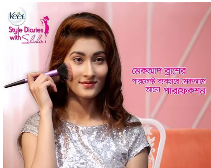
Illustration 1: Static post of Veet Bangladesh, 2017

Secondly, choosing words for commercial ads always I need to think something eye catchy. It can be any question or any give solution with problems. I have also learned the content and how I should write creative a post copy. Like, in creative copy I will write only the main theme of the topic within 8-10 words. In post copy I can give a very short sense, what my ad is presenting, what the ad actually wants to say, what their purposes etc is.