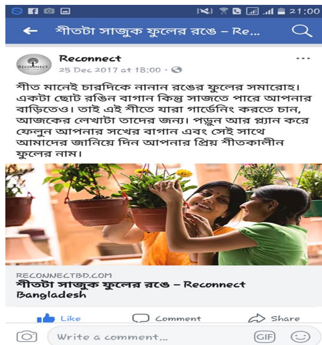
Illustration 5: Regular post of Reconnect, 2017

can see a distance in the relationship between children and parents. Actually this projects starts after Holy-artisan incident, and by this project it is trying to explore that, we all have different stories with our parents from our childhood, so this is the time not make distance with them, make a healthy relationship with family. Also tips for parents how they can, how they should etc. but it was complicated to me, because the tone for parents and children should be different. At the beginning, I was confused and sometimes I wrote in a wrong way. But, now I have a clear idea about the writhing style and also about the tone. Now we give tips on different problems, different aspects of a family. How the relationship of parents and children can be good we always try to give that massage through our writing. I am lucky enough, that I am working with such a nice and very learning one. Reconnect this project and writing for this was one of my love for those days. Because, it was something very close to anyone’s heart. Sometimes I also shared my own experiences and feelings for my parents through my writing in this project.