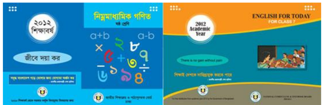
Some of the cover pages of Grade VI and VII textbooks

This needs to be mentioned that the unit had designed, illustrated and made Grade I and II textbooks of NCTB into four colors last year for both Bangla and English version students for the academic year 2011 which are currently being used by all the children of Bangladesh following the national curriculum. The opportunity surfaced as a result of the unit having a good alliance with the NCTB; as well as NCTB having adequate trust in the institute's capability that is being developed and maintained consistently.