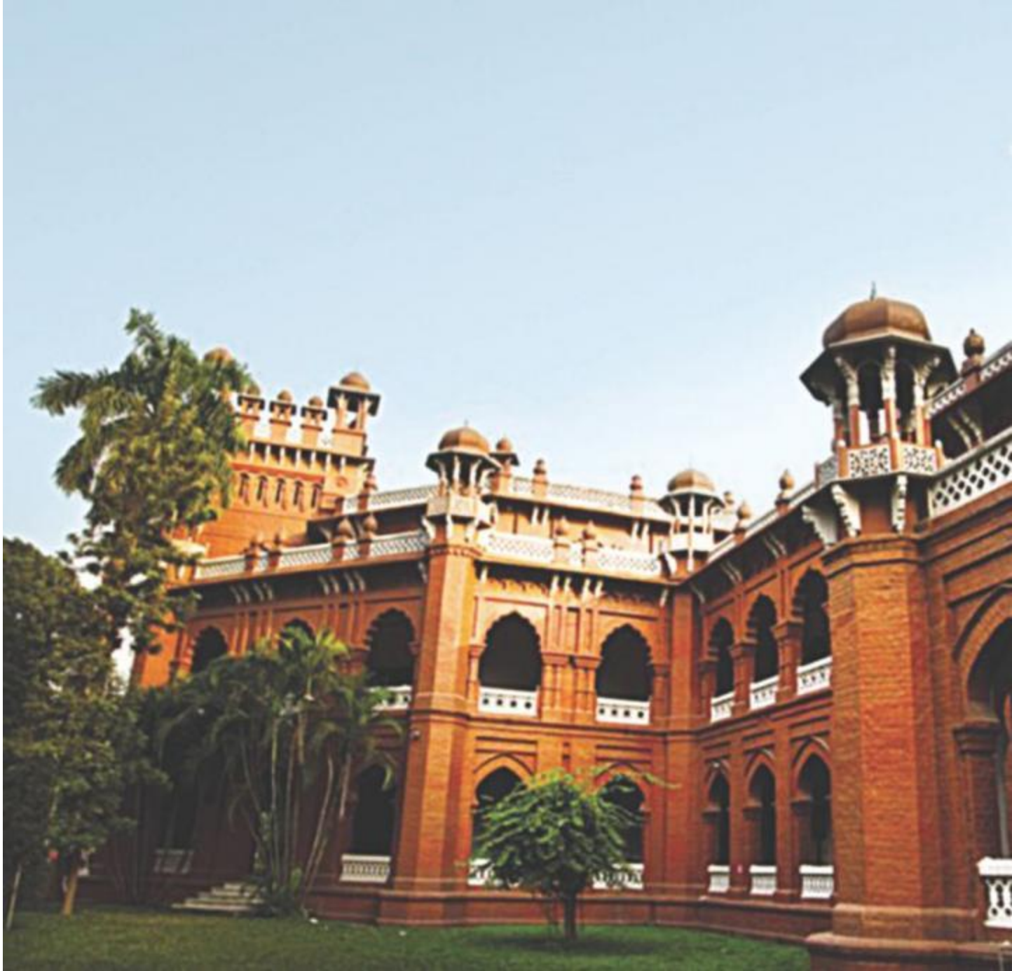
The Curzon Hall located in the University of Dhaka campus area, was named after the incumbent Viceroy Lord Curzon, who laid the foundation of the building on February 14, 1904. The two-story building represents a hybrid of European and Indian architectural styles.

Staying in that neighbourhood, lets pay a visit to the Faculty of Arts, more commonly known as the Art College. The building, where aspiring artists get their training year after year, is itself a work of art. It is one of the earliest creations of Muzharul Islam,