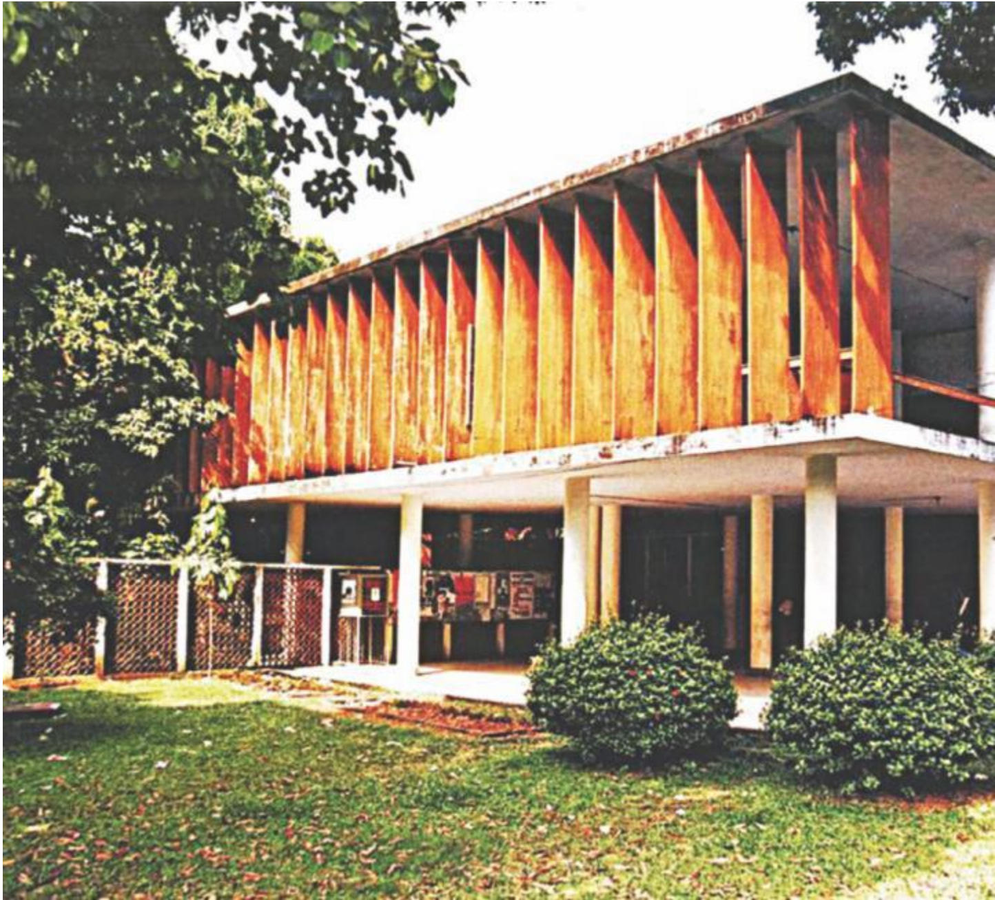
The Faculty of Fine Arts building, designed by Muzharul Islam, signalled the beginning of Bengali modernism in the architecture of the then East Pakistan.

This is what the book does. It opens our eyes, makes us see our familiar buildings in a different way and introduces us to buildings we have not seen or even knew existed in Dhaka. But this is not just a book on buildings and architecture. It is an account of the evolution of a city and its residents who, caught in the whirlwinds of modernity, of tumultuous political and economic change, of a senseless construction mania,