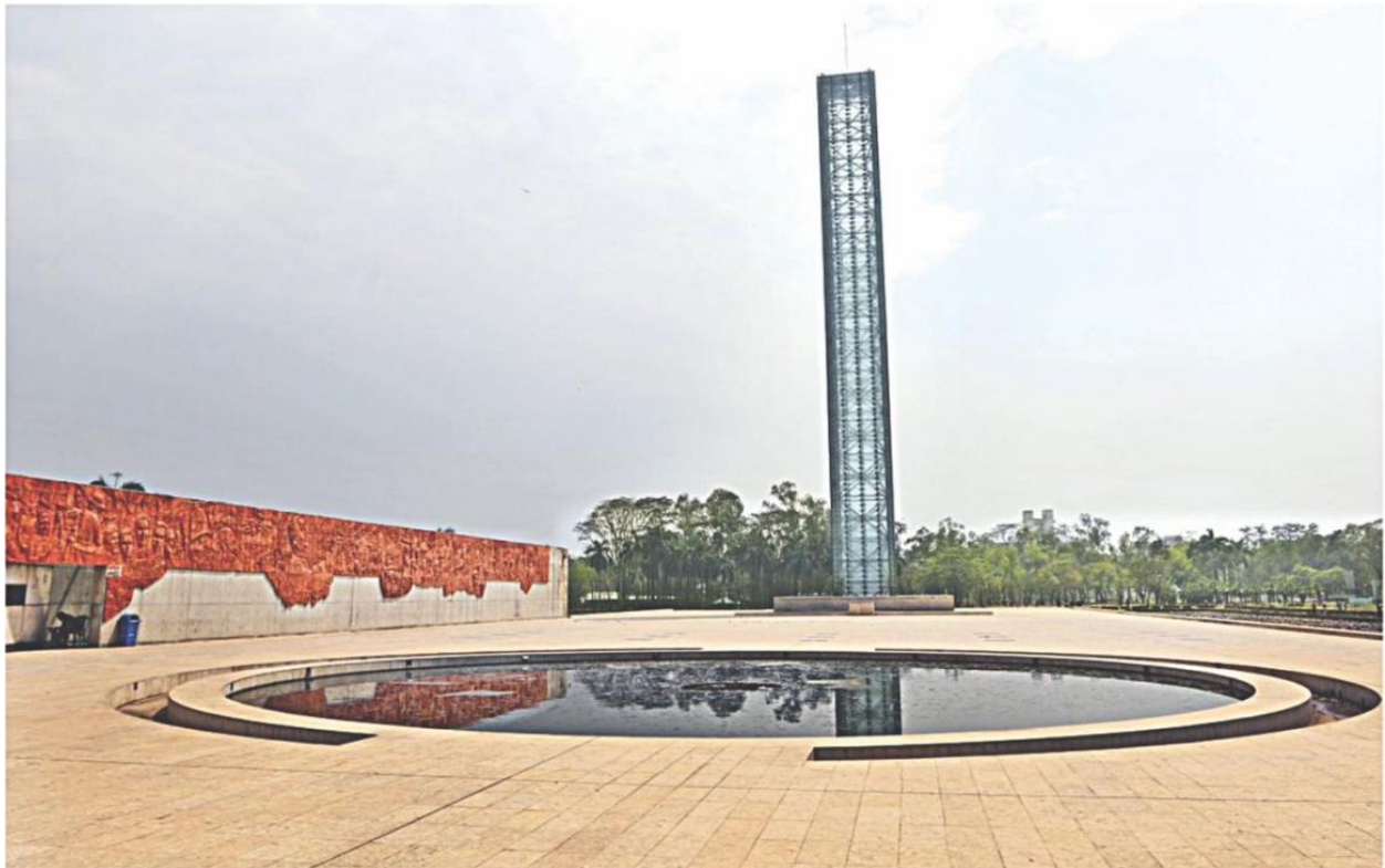
The Swadhinata Stambha (Independence Monument), designed by Marina Tabassum and Kasheb Mahboob Chowdhury alongside the Museum of Independence, was the winning entry of a national architectural competition held in 1997.