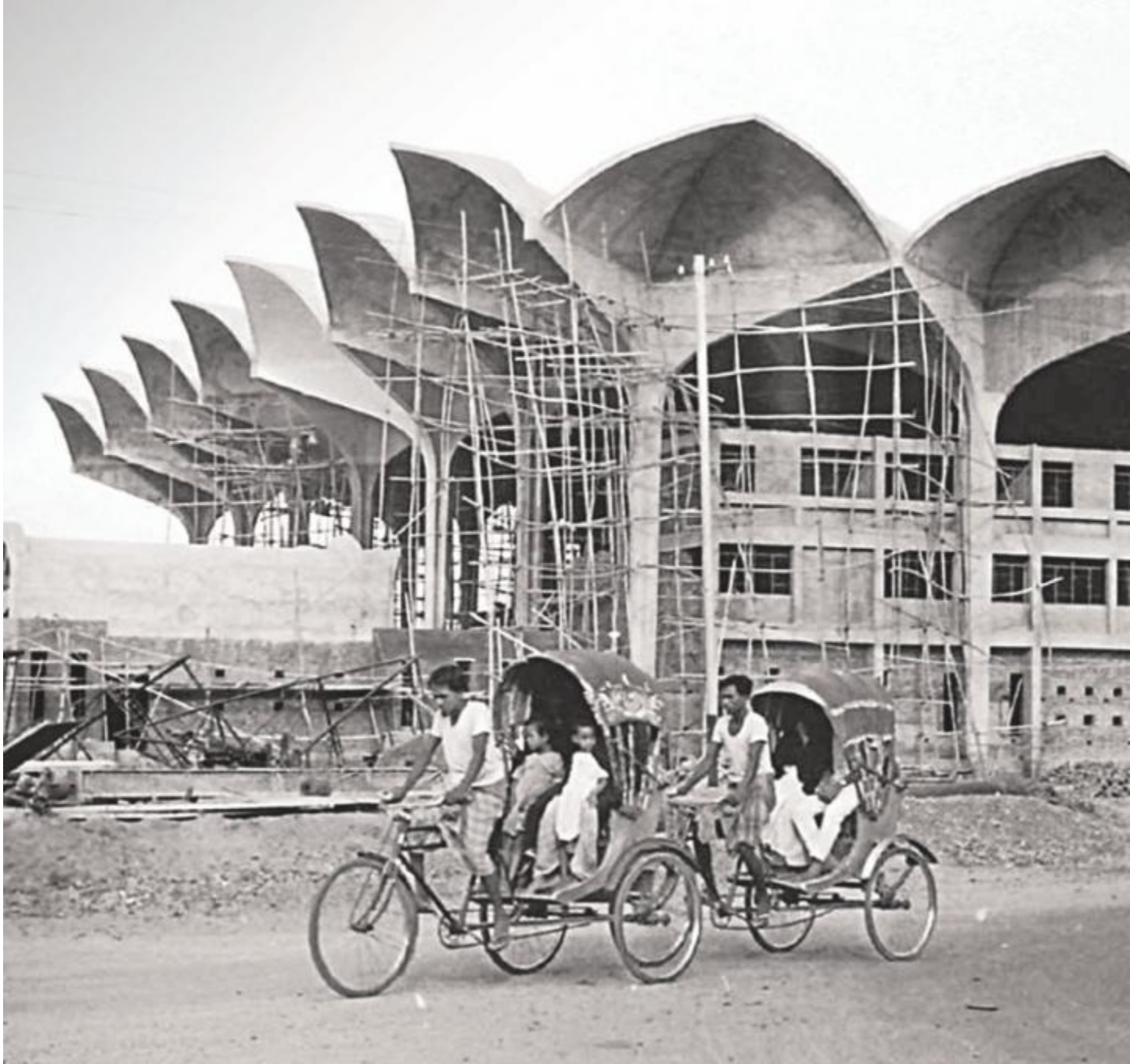
The Kamalapur Railway Station, designed Daniel C Dunham and Robert G Boughey, creates a light-filled and cross-ventilated train terminal, reminiscent of Mughal pavilions, with deep recessed spatial volumes.

The core feature of this eminently readable book consists of short descriptions of the 25 buildings. These descriptions, full of memorable phrases as the ones I have quoted, cover rich architectural details of the buildings but also the historical, political, economic and policy context in which these buildings were conceived and designed.