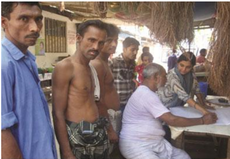
Slum dwellers and TB research team members of JPGSPH, BRACU taking part in PRA social mapping and listing of service providers in Sattola slum

This software is being used on trial basis in undergraduate program of BRAC University and can be a huge resource for JPGSPH specially for the faculty members who regularly have to deal with the students regarding their assignment, grades, announcements notice etc,